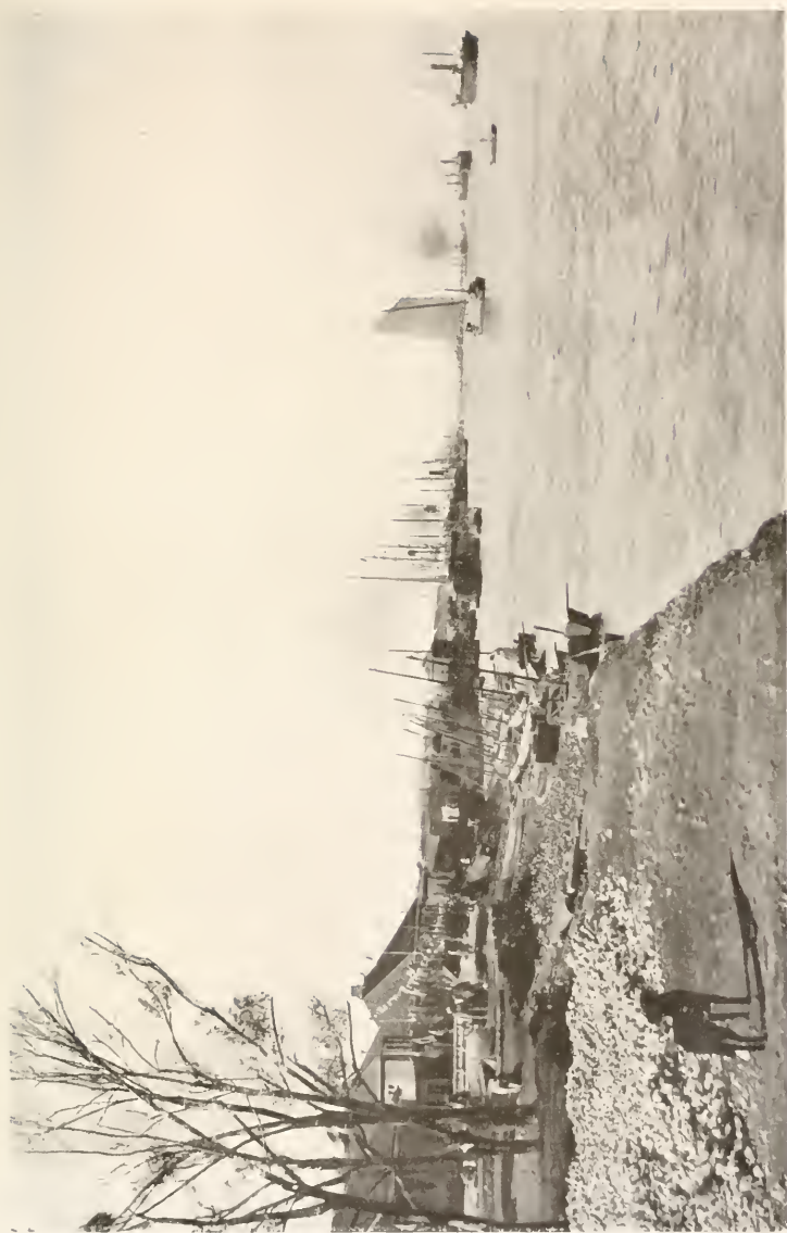
THE SWAMPY HARBOUR OF NEUCHWANG