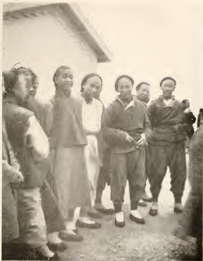
A MORE HARMLESS-LOOKING SET OF PEOPLE WOULD BE DIFFICULT TO IMAGINE