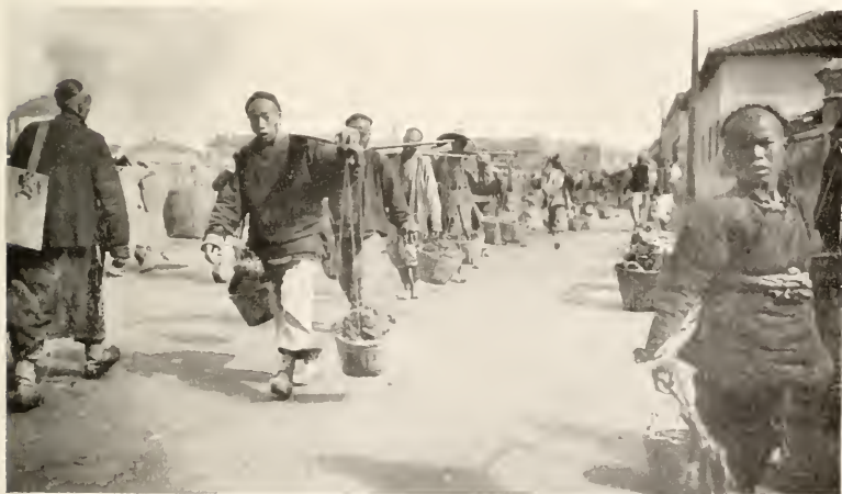
A CENTRE OF INDUSTRIES WHICH PROFOUNDLY AFFECT THE ENTIRE COUNTRY