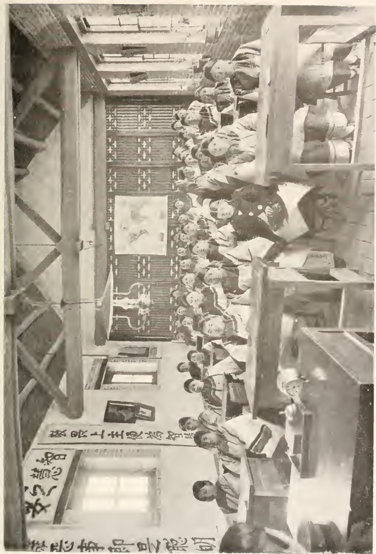
A HIGHER MORALITY THAN THAT WHICH EXISTS AROUND THEM