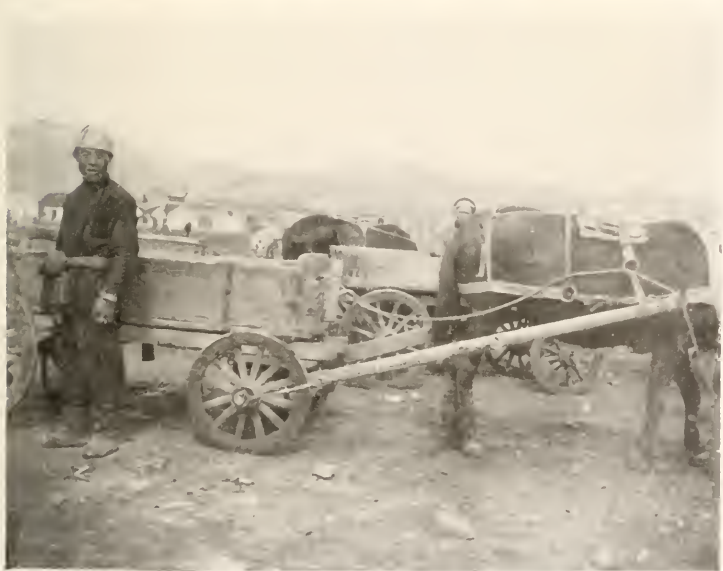
IN PORT ARTHUR TO-DAY