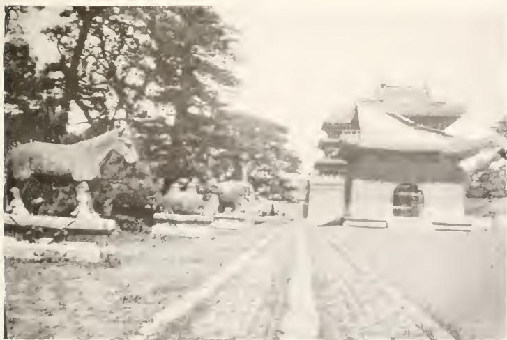
SUDDENLY, THE WAY WAS PAVED WITH BIG SQUARE BLOCKS