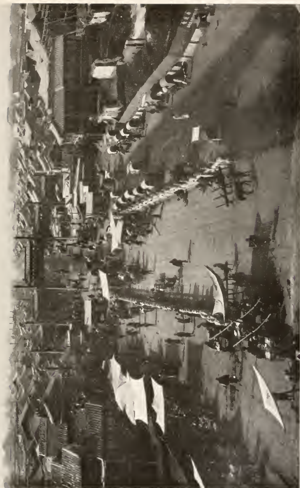
THE BROAD THOROUGHFARE WHICH TARTAR CONQUERORS DROVE THROUGH THE PACKED CAPITAL THEY FOUND