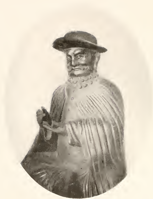
THE BLACK-HATTED STATUE IN THE HEART OF CANTON