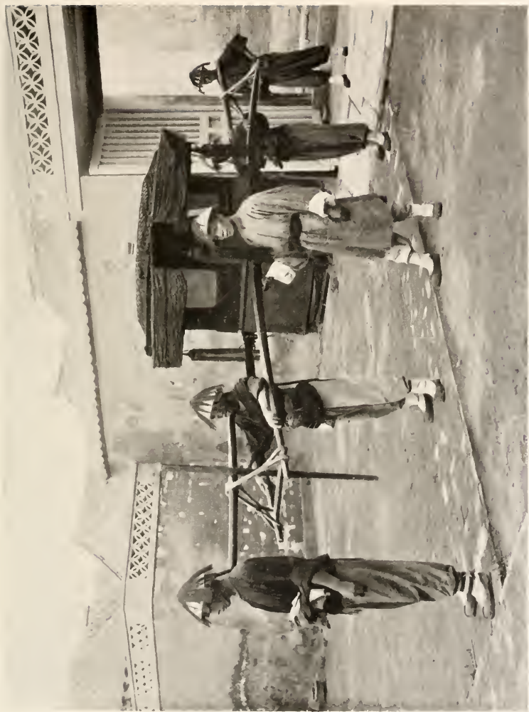
A HOT MORNING SPENT IN INTERVIEWING SMILING CHINESE OFFICIALS