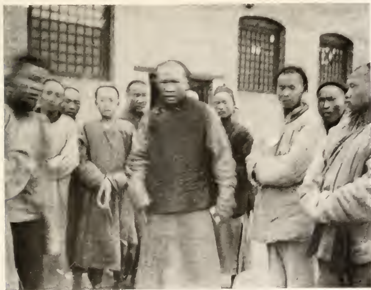
I WAS IN TIME TO INSPECT ONE OF THE LAST OF THE GANGS OF COOLIES TO BE DESPATCHED TO SOUTH AFRICA