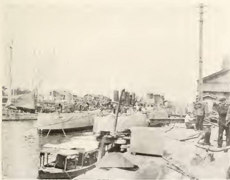
DOCKYARDS IN KOBE AND OSAKA, WHERE . . . GUNBOATS WERE BEING MANUFACTURED FOR THE CHINESE GOVERNMENT