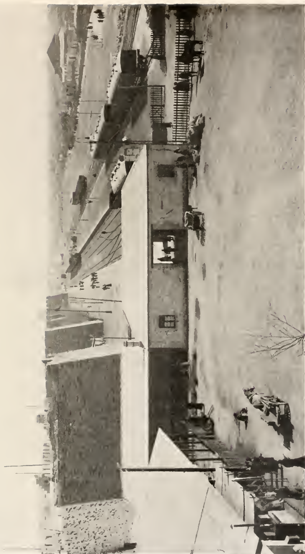
WHERE GREY KEEPS AND BATTLEMENTS TOWERED