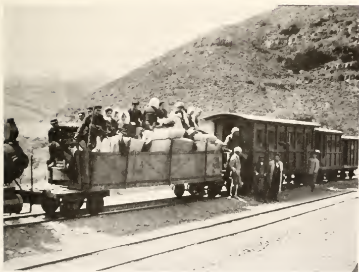
DAYLIGHT SAW US AGAIN IN THE TRAIN