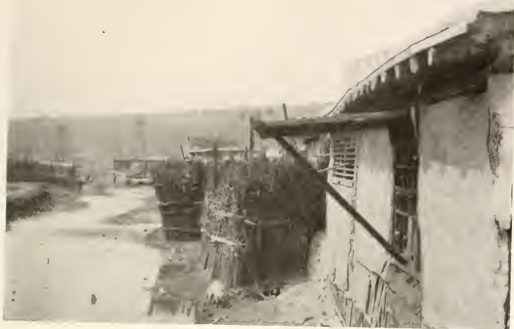
OUTSIDE THE CITY