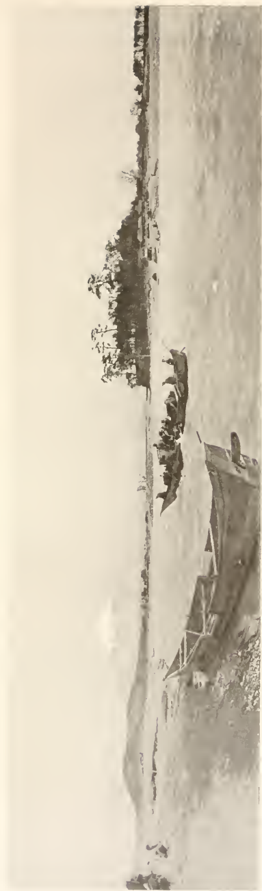
AN EMERALD AND SAPPHIRE TRAINING GROUND FOR JAPANESE SEAMEN