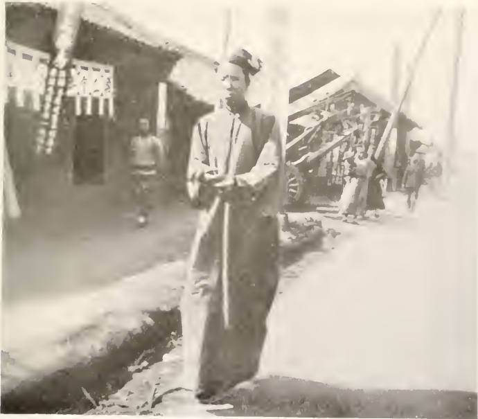
IN THE STREETS OF MUKDEN