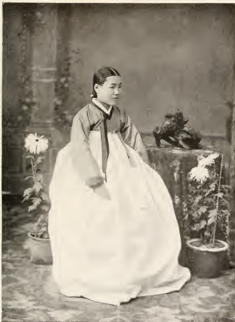
IN HOMELY VOLUMINOUS WHITE PETTICOAT