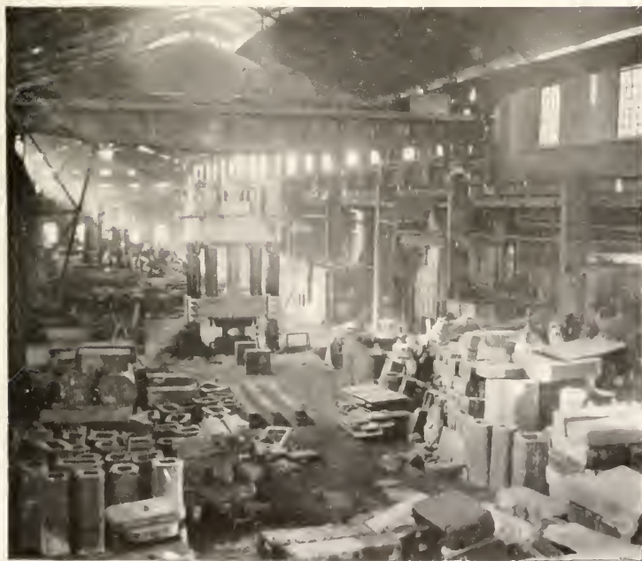
IRON AND STEEL WORKS IN MIDDLE CHINA