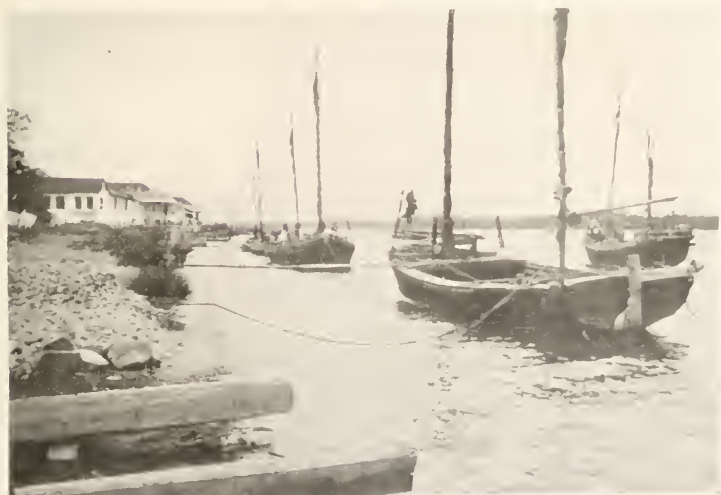
THE MAINLAND OF JOHORE.