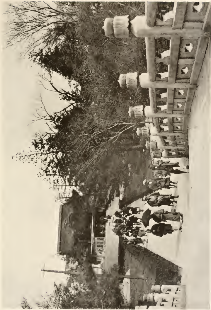
TO SEE THE LACQUER AND GILT TEMPLES