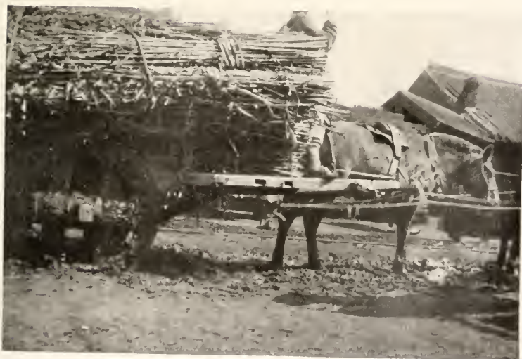
A LOAD OF MANCHURIAN MILLET