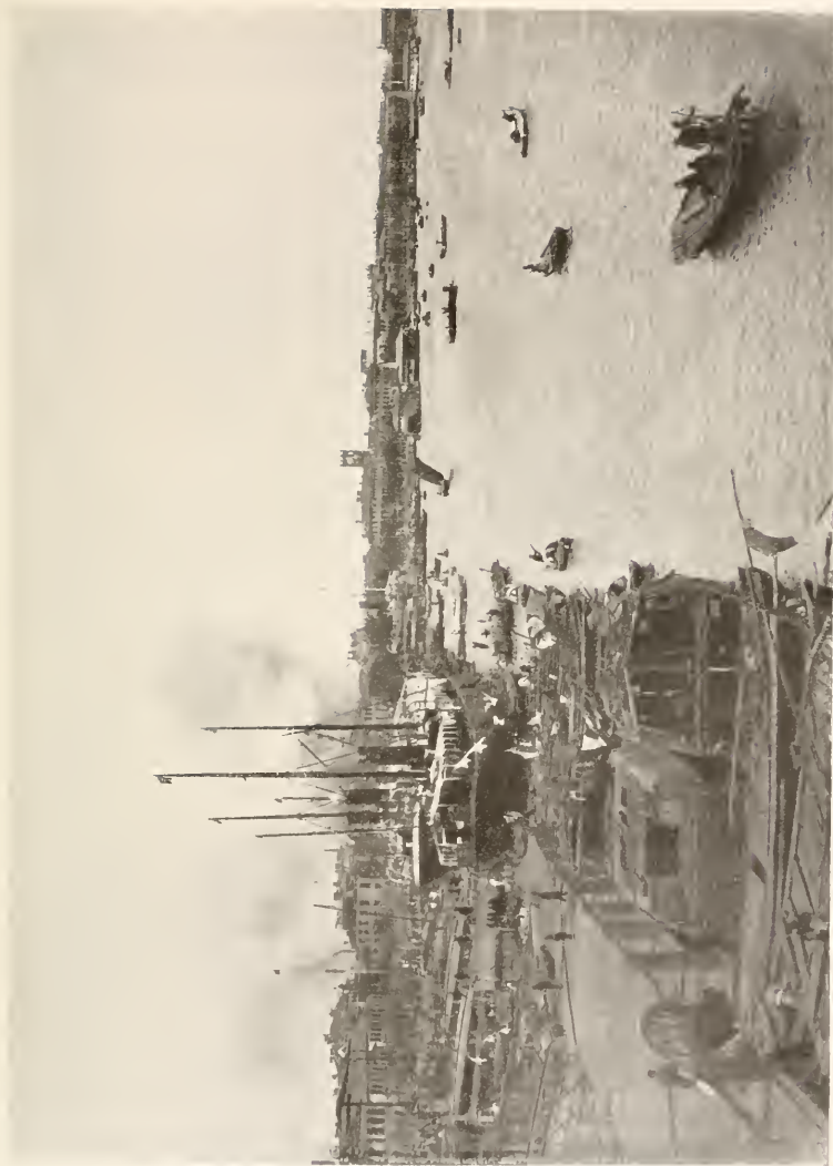
THE JETTIES, FACTORIES AND DOCKS OF THE CITY HAVE NEVER BEEN MORE ACTIVE