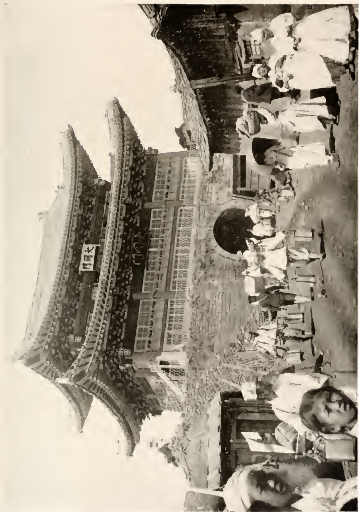
BENEATH THE WALLS OF AN OLD KOREAN CITY