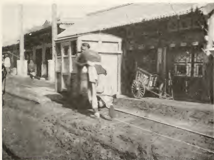
LOCOMOTION IN MUKDEN