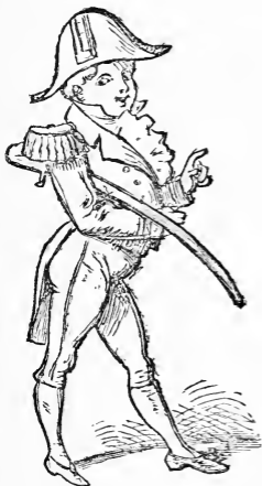
SIR JOSEPH PORTER, K.C.B.