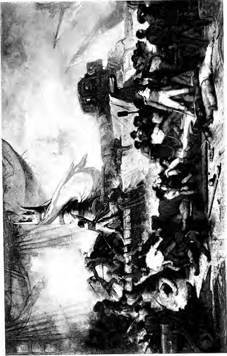
The French "Glorieuse" Flag-ship of Rear-Admiral Hagen engaging the U.S. "Porpoise" at the Battle of Hopholzer