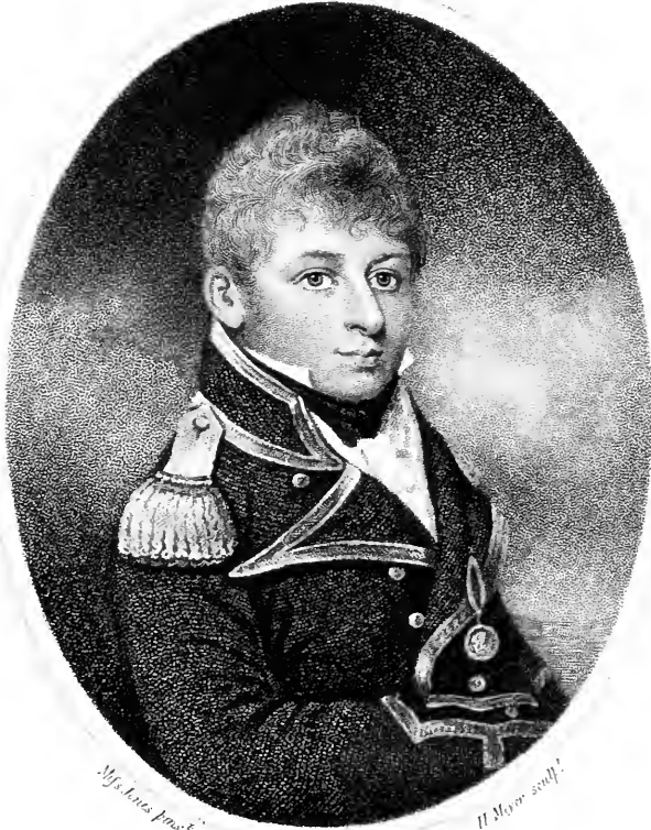
Captain George Nicholas Hardinge. From a Portrait in the Possession of Viscount Hardinge.