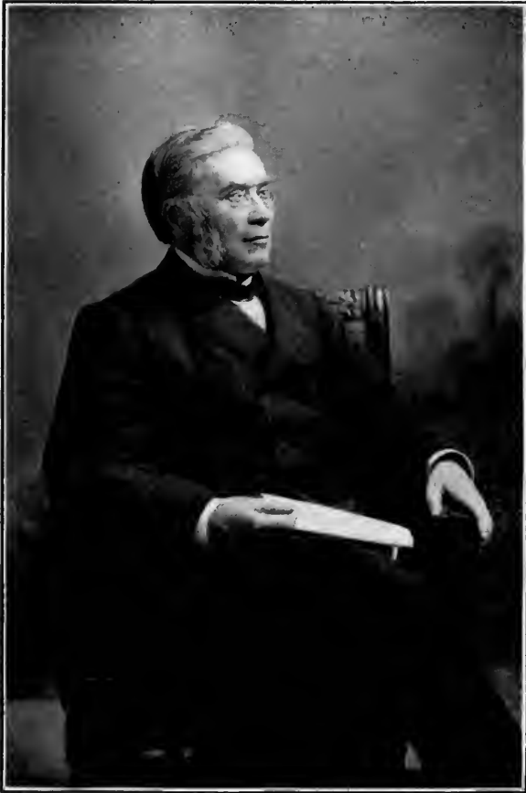
HON. OLIVER MOWAT, Q.C., LL.D.