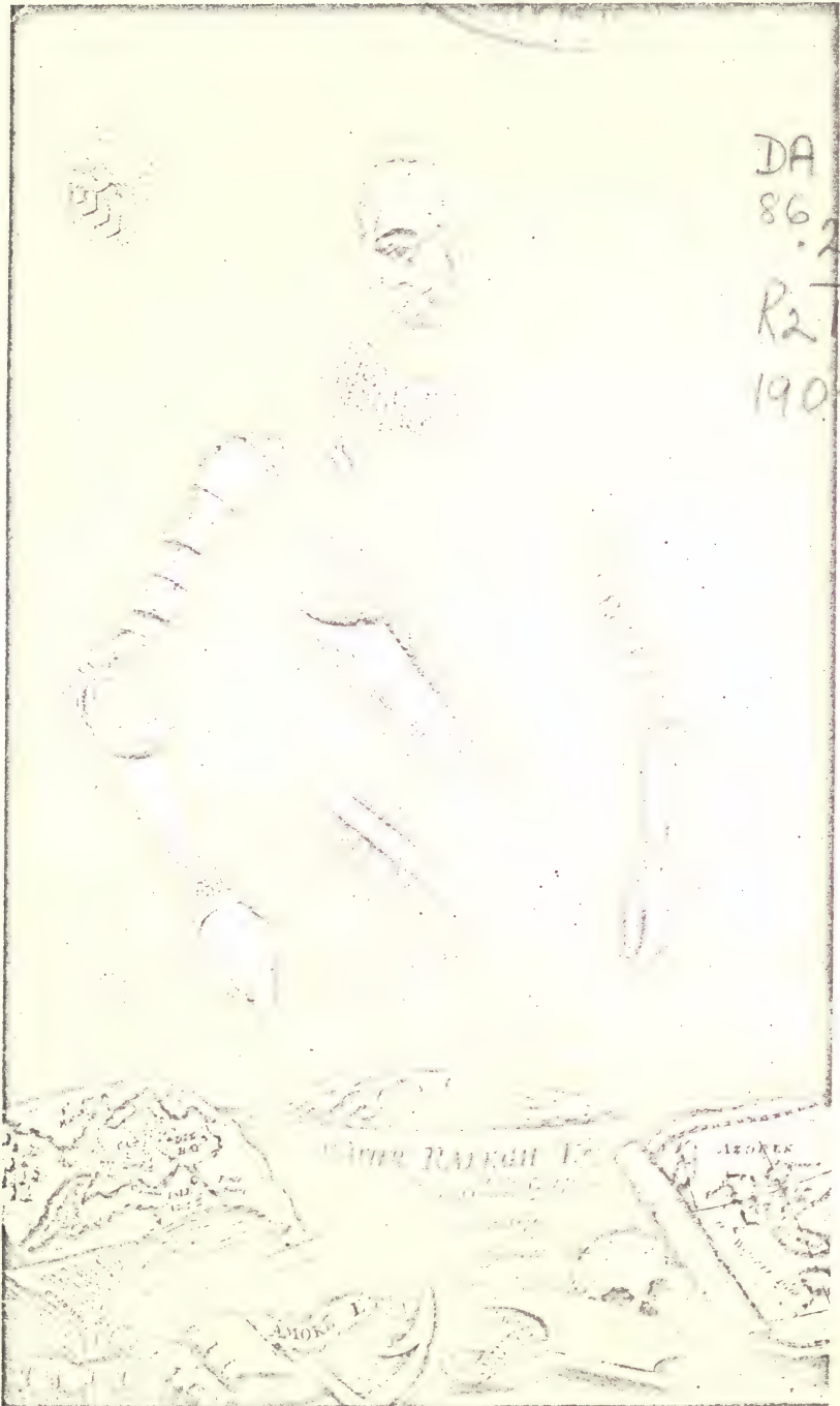
4. Linnæus del. et sculp. 1748.