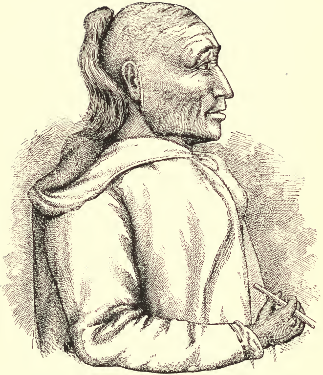
An Indian of the last century.