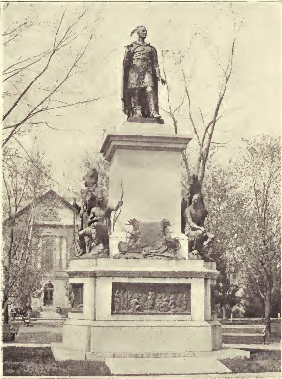
Brant Monument at Brantford. (Opp. p. 116.)