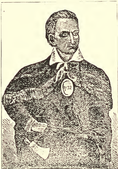
Sa-go-ye-wah-ta, (Opp. p. 44.)