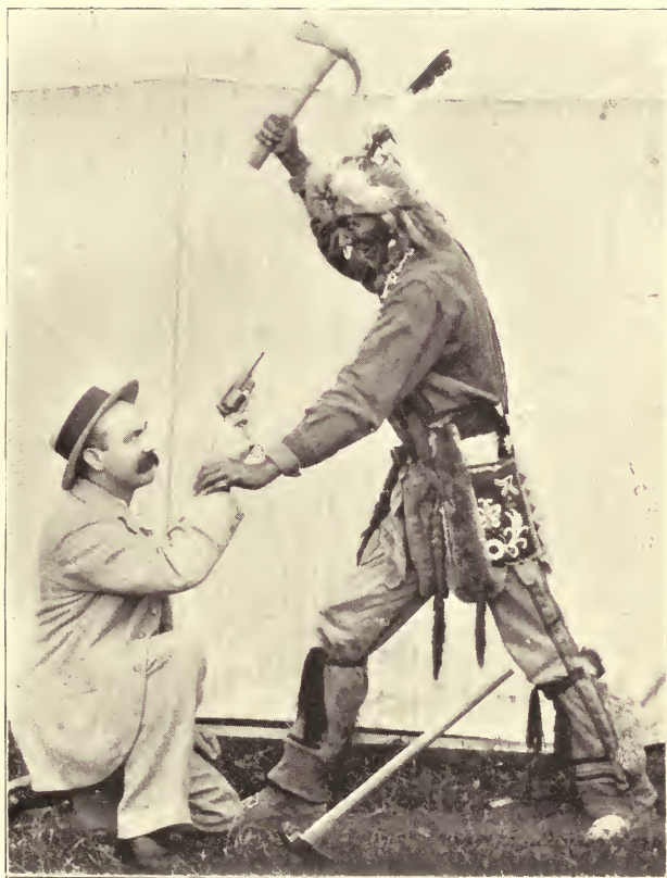
A disposition to hark back.