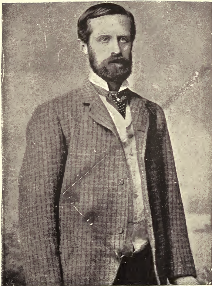
His Excellency the Governor-General