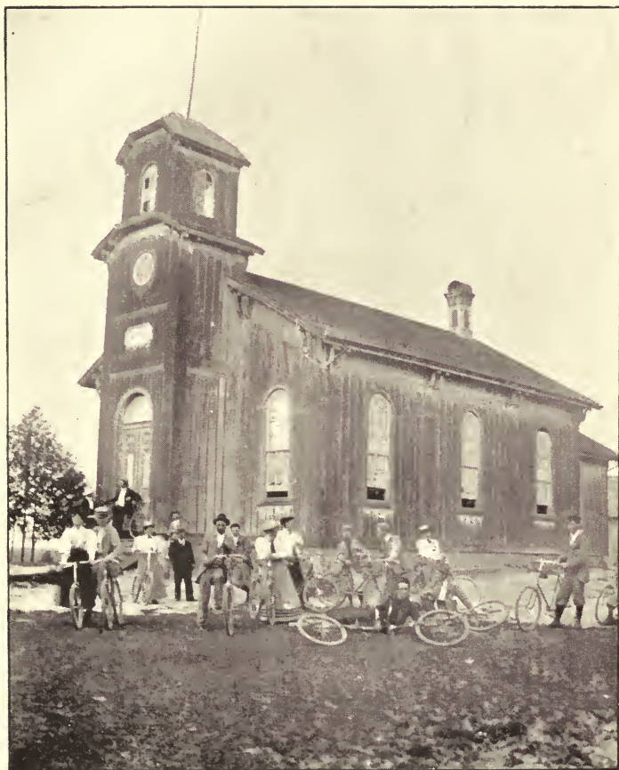
Six-Nations Council House