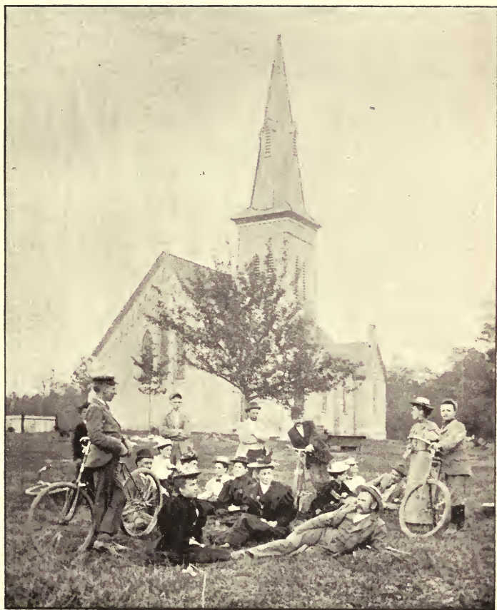
St. Paul's (Church of England).