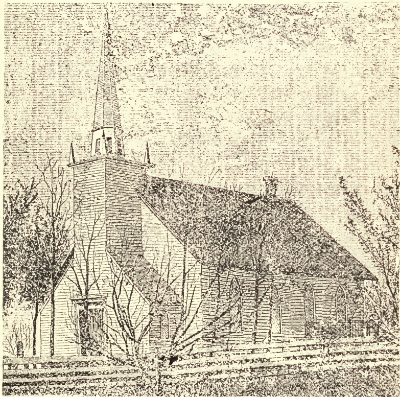
The old Mohawk Church, near Brantford