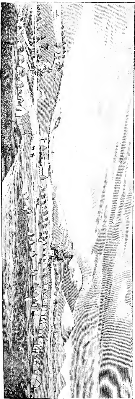
CAMP TILDEN, MITCHELL'S STATION, VA.