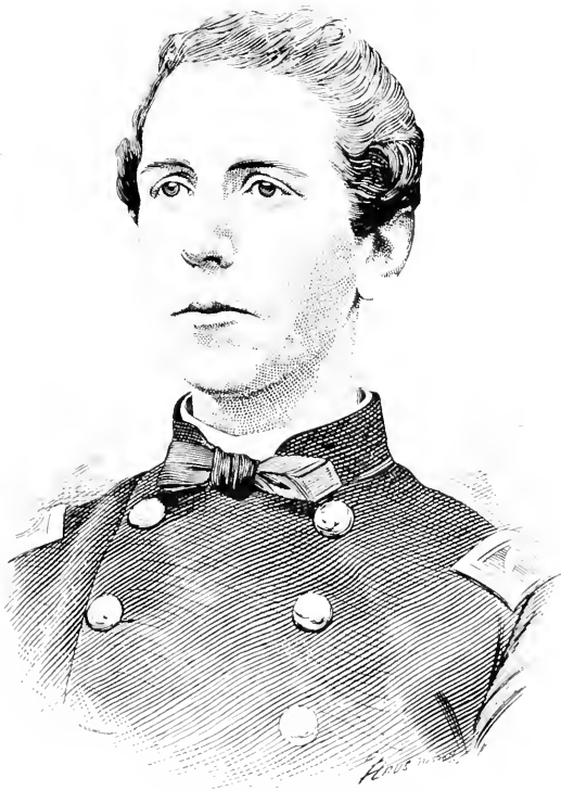
COLONEL, AND BREV. BRIGADIER-GENERAL.