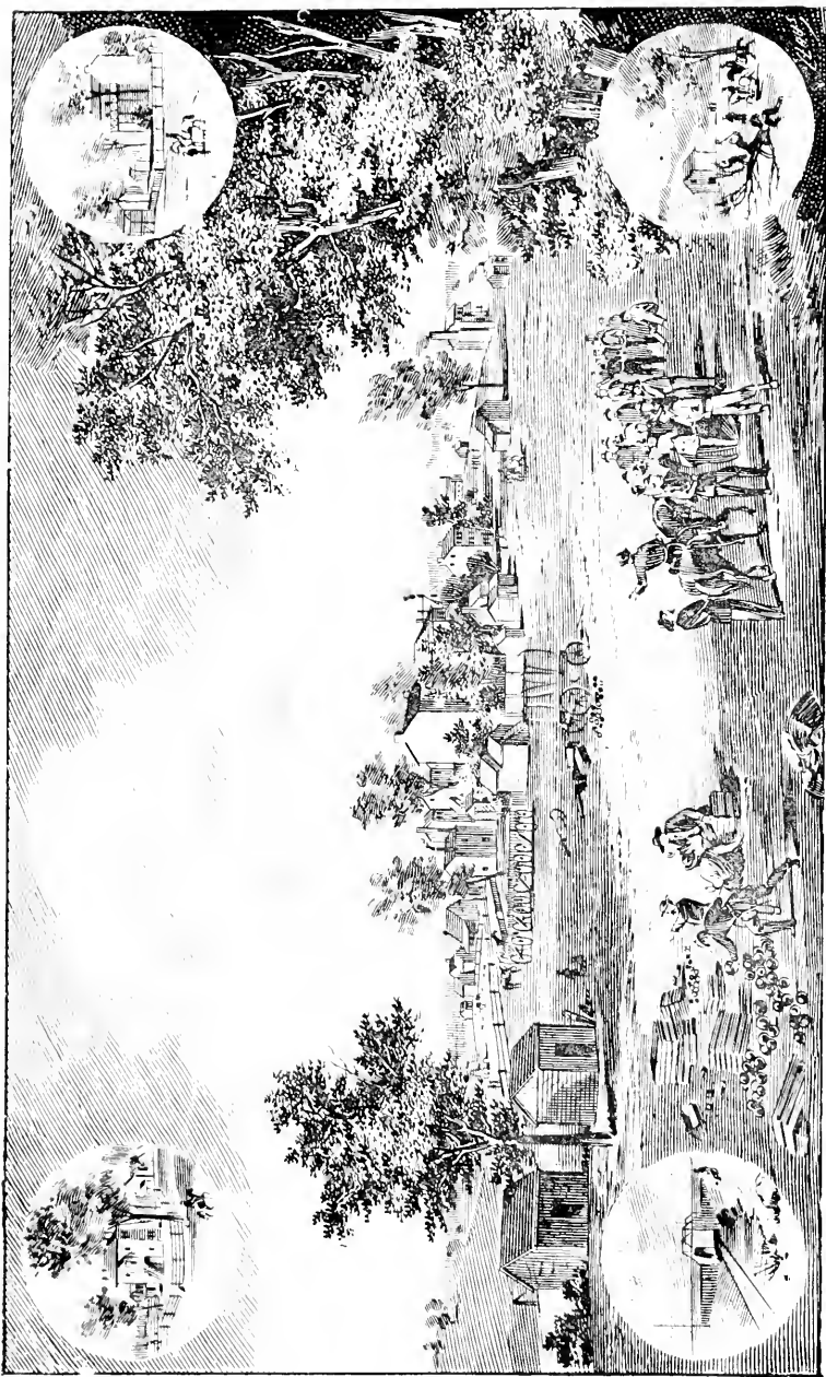
APPOMATTOX C. H., PLACE OF LEE'S SURRENDER.