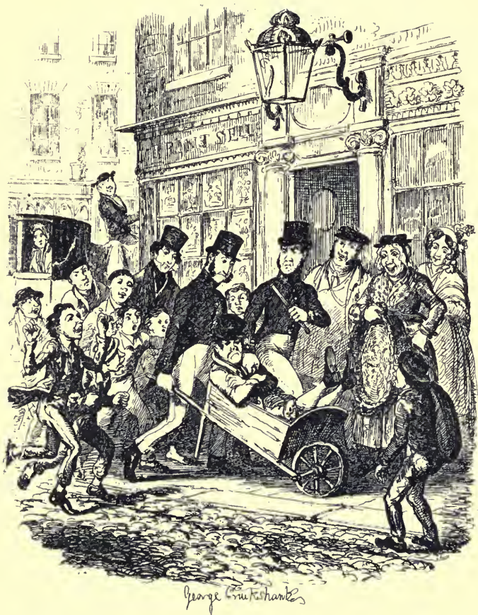
A Pickpocket in Custody