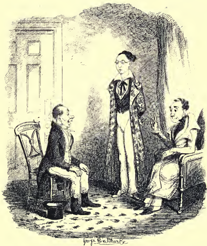
The Boarding House