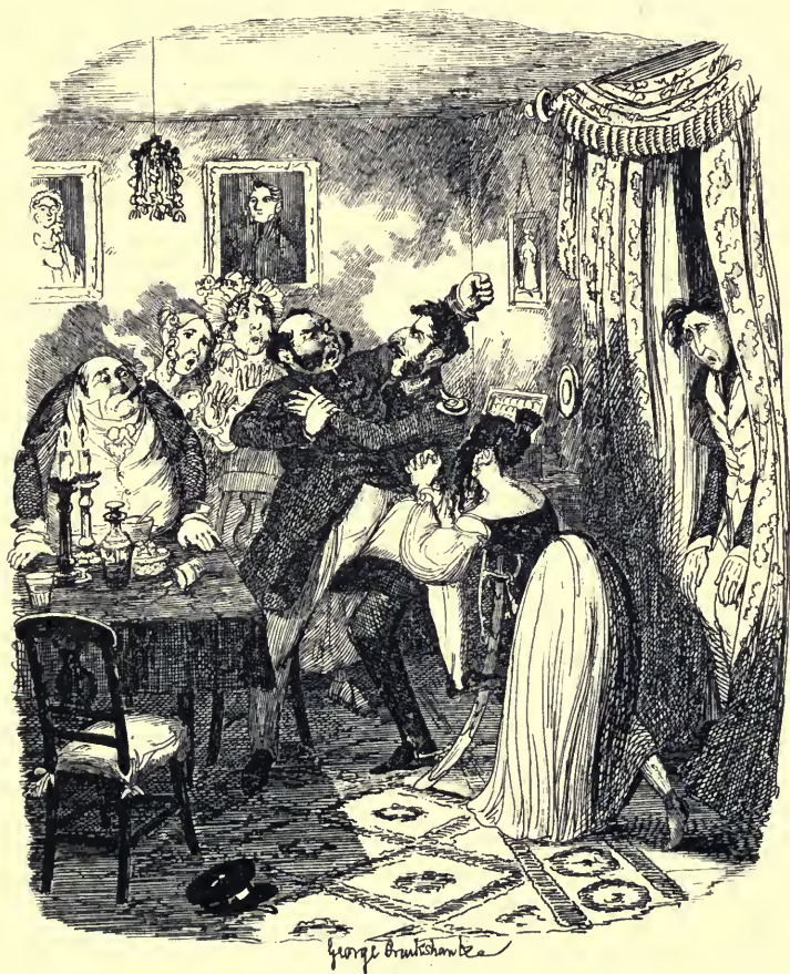
The Tuggs at Ramsgate.