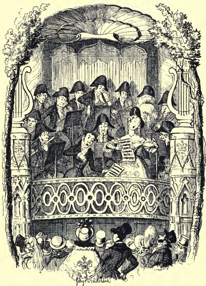
Vauxhall Gardens by Day