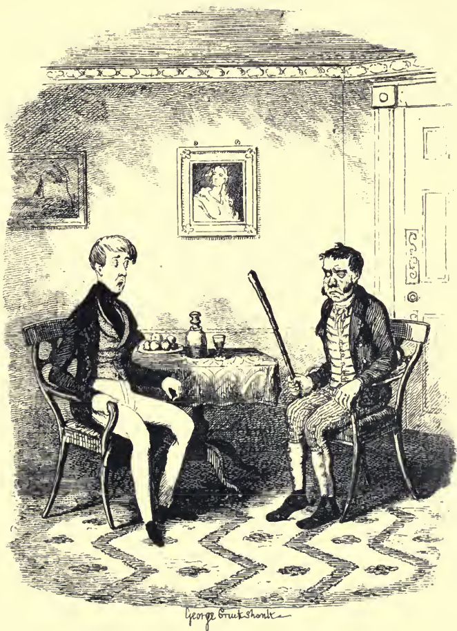
The Wexford Duel