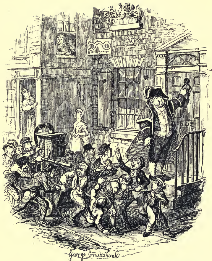
The Parish Engine