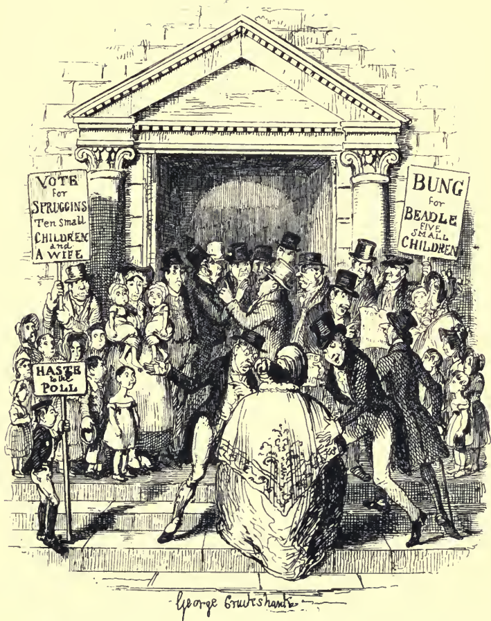
The Election for Beadle