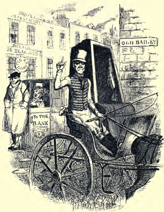
The Last Cabdriver