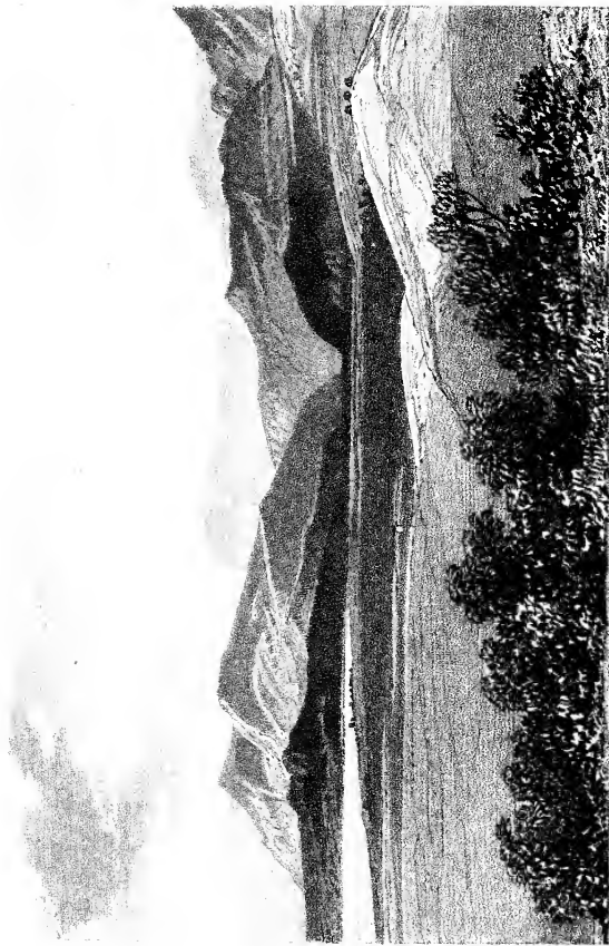
Sketched by Sir John Lubbock