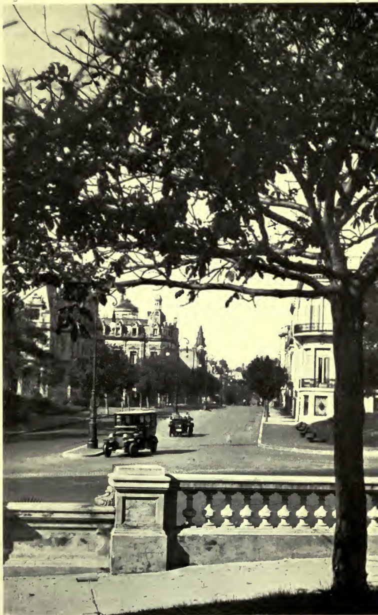
ALVAER AVENUE IN BUENOS AIRES. A SUPERB RESIDENCE STREET