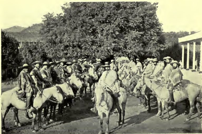
A FINE GROUP OF GAUCHOS AT A COUNTRY ESTATE