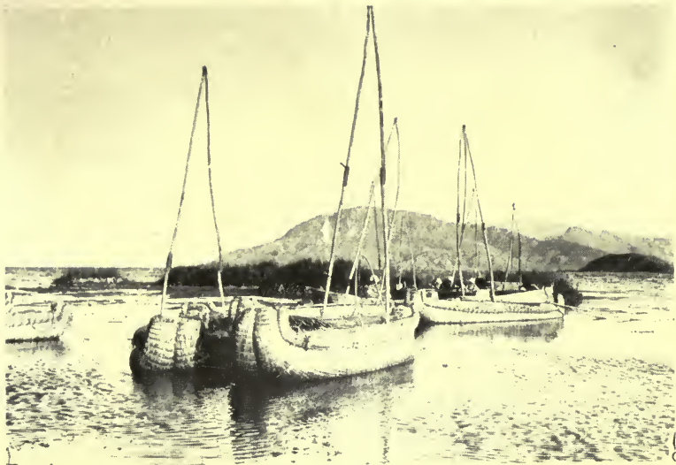
"LAS BALSAS" REED BOATS, LAKE TITICACA