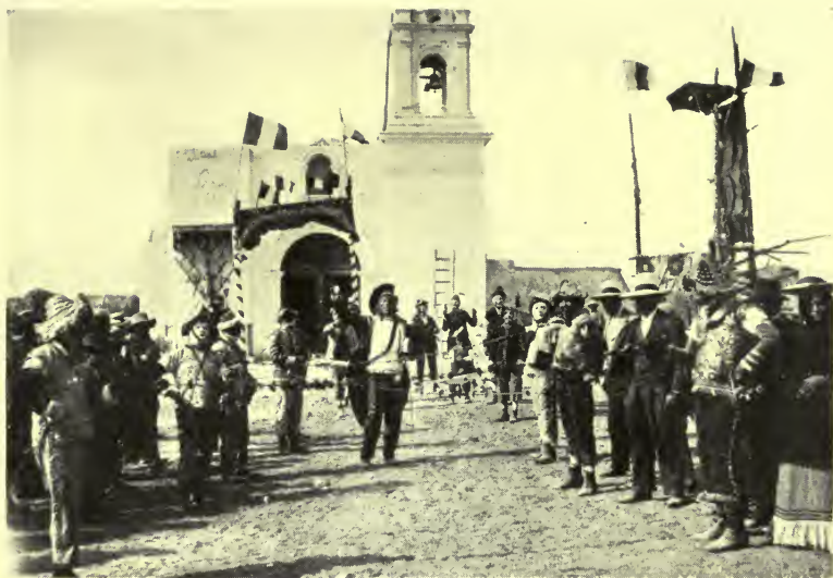
MASKED DANCERS AT CARMEN ALTO, PERU, DURING CARNIVAL