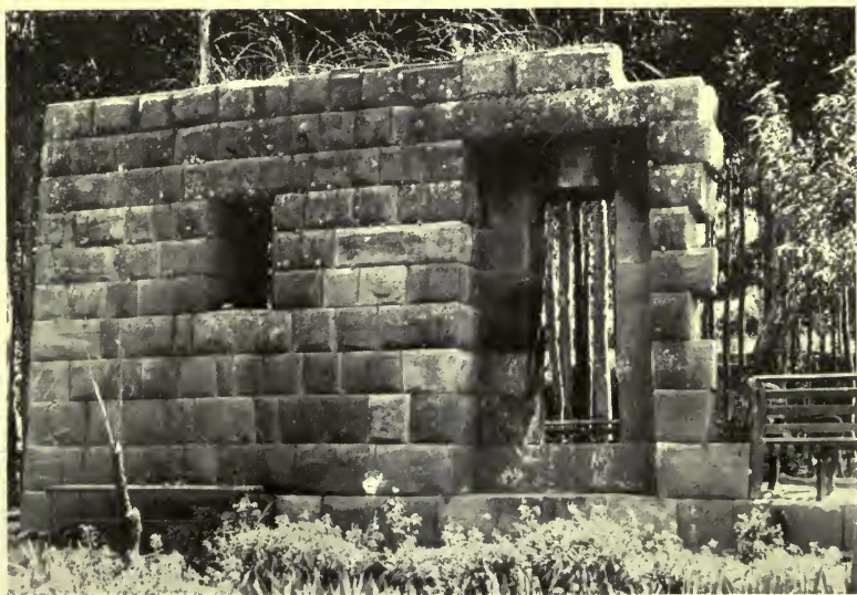
RUINS, PALACE OF THE ÑNCA, CUZCO