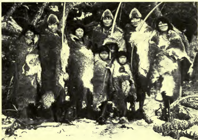
TYPES OF A PATAGONIAN INDIAN TRIBE OF SOUTHERN CHILE