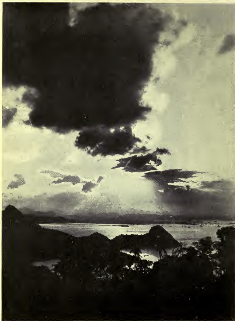
SUNSET AT RIO HARBOR