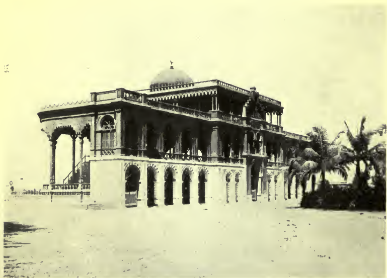
THE JOCKEY CLUB STAND, HIPPODROME, BUENOS AIRES