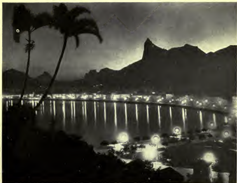
THE BEAUTIFUL BAY OF BOTAFOGA AND THE CITY OF RIO DE JANEIRO BY NIGHT SHOWING THE PEAK OF CORCOVADO IN THE DISTANCE AT AN ALTITUDE OF ABOUT THREE THOUSAND FEET