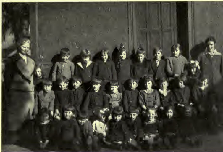
A CLASS IN AN AMERICAN GIRLS' SCHOOL IN SANTIAGO