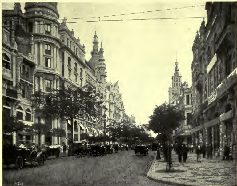
AVENIDA RIO BRANCO, RIO DE JANEIRO, BRAZIL A NOTABLE AVENUE IN SOUTH AMERICA