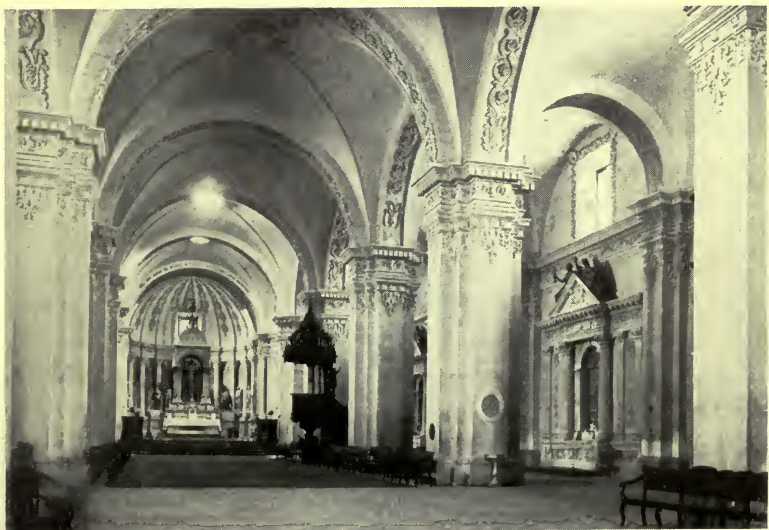
INTERIOR OF CATHEDRAL AREQUIPA