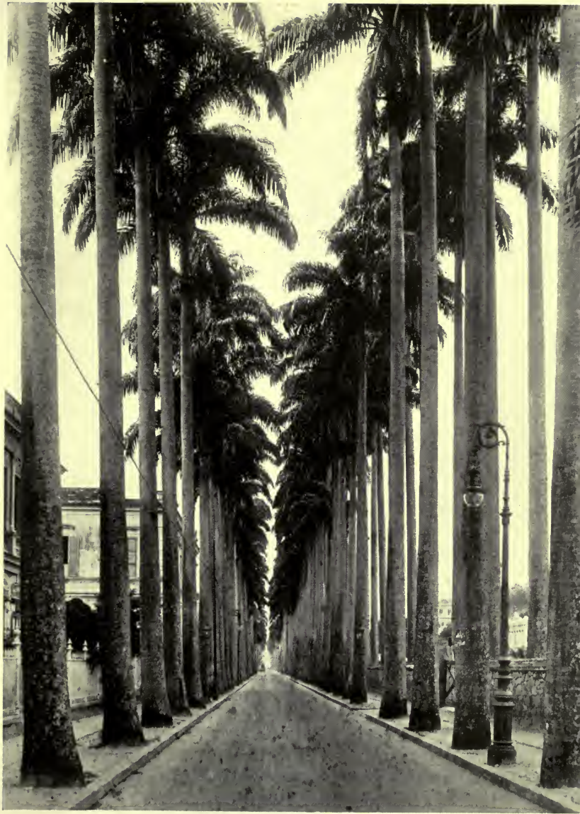
ONE OF THE BEAUTIFUL AVENUES OF ROYAL PALMS IN RIO DE JANEIRO