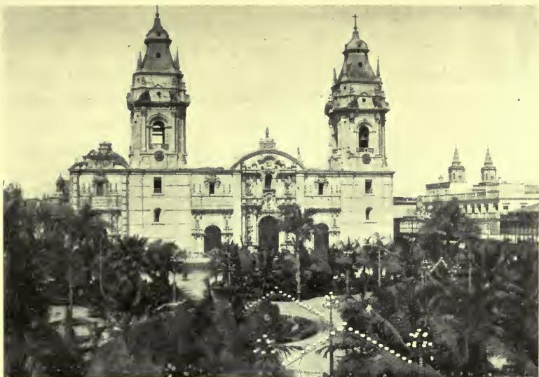
CATHEDRAL FROM PLAZA, LIMA