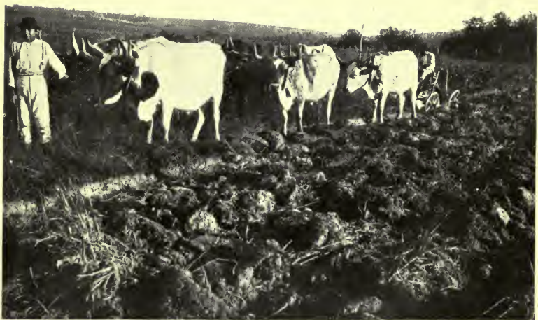
PRIMITIVE PLOWING IN CHILE