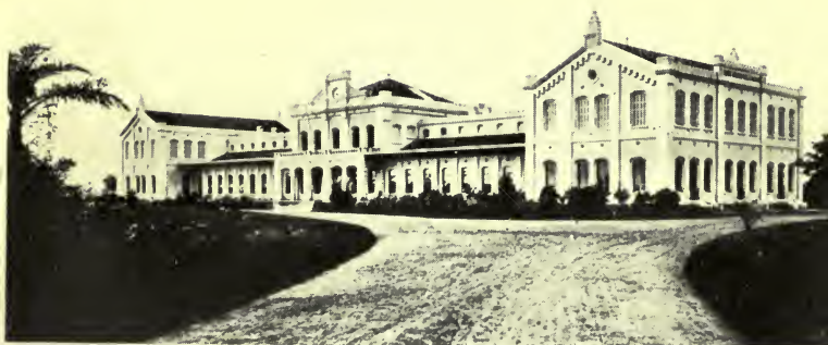
AN AGRICULTURAL COLLEGE, SAO PAULO