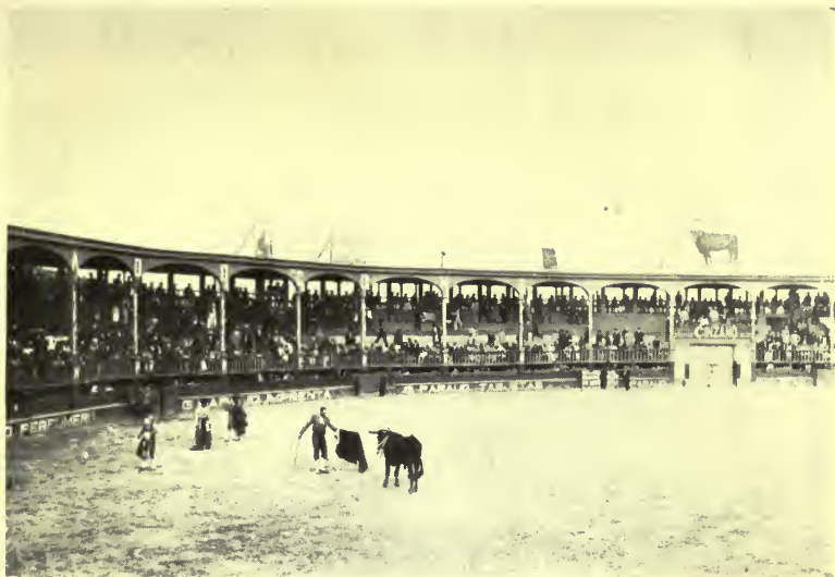
THE BULL RING, LIMA