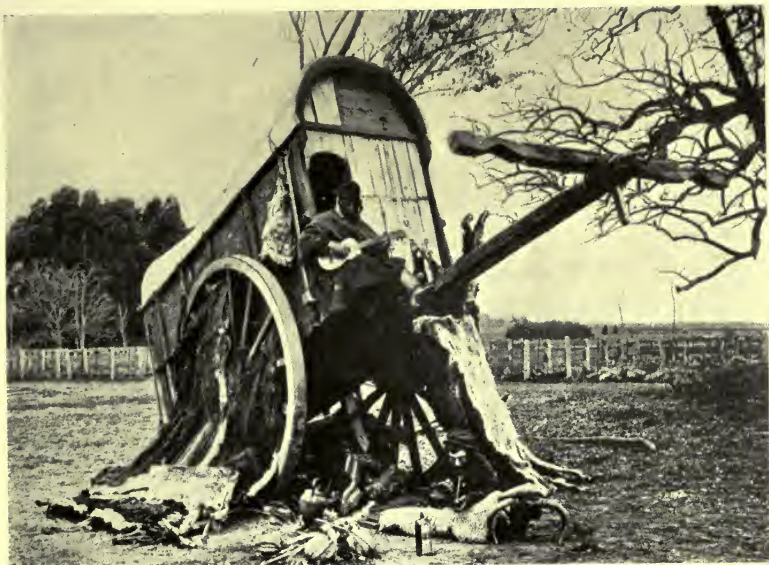
THE GAUCHO AS A WANDERING MINSTREL