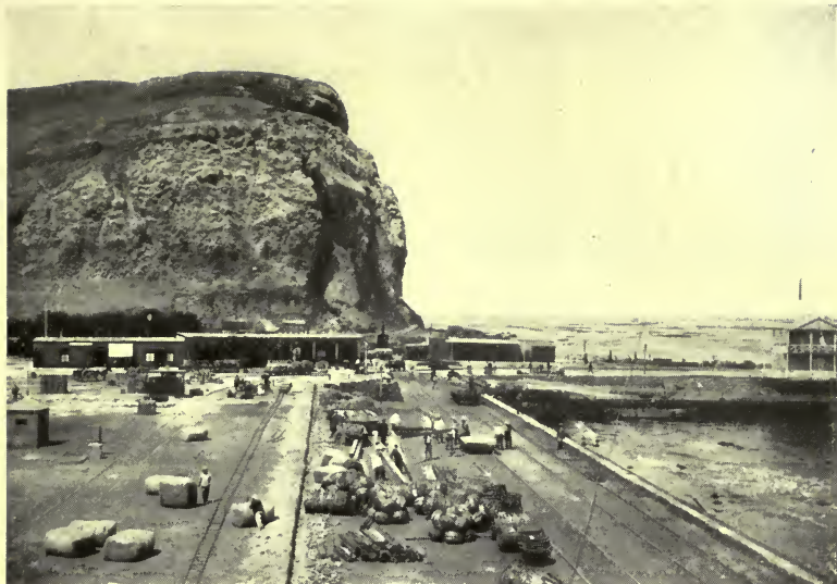
ARICA, THE TERMINUS OF THE NEW CHILEAN RAILROAD FROM LA PAZ