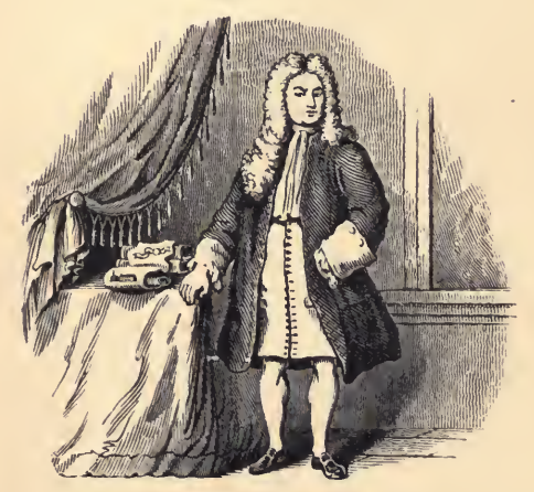
Washington, D. C.