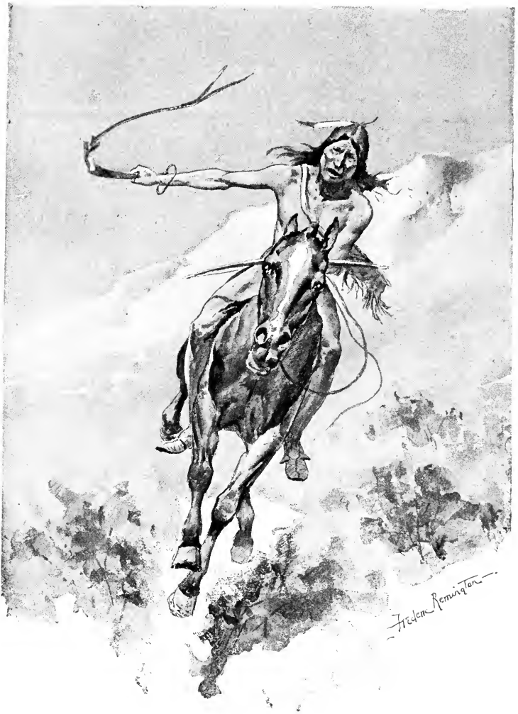
THE WAR WHOOP.