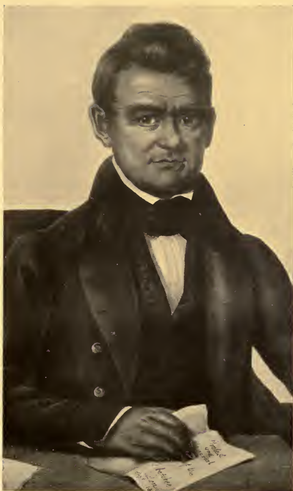
JOHN ROSS, PRINCIPAL CHIEF OF THE CHEROKEES