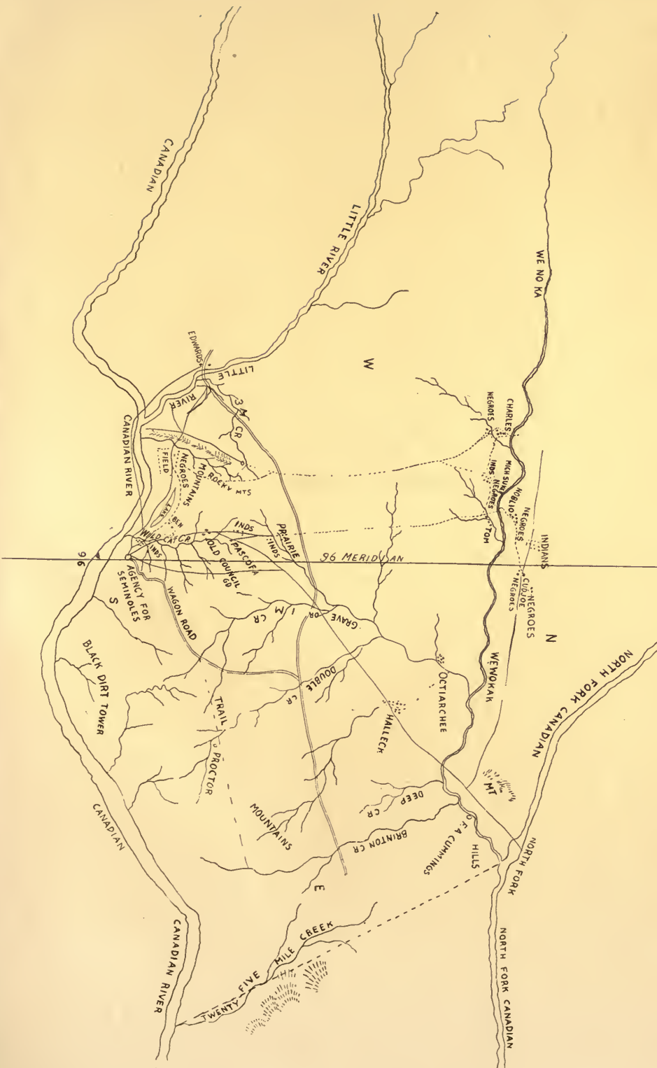
MAP SHOWING FREE NEGRO SETTLEMENTS IN THE CREEK COUNTRY [From Office of Indian Affairs]