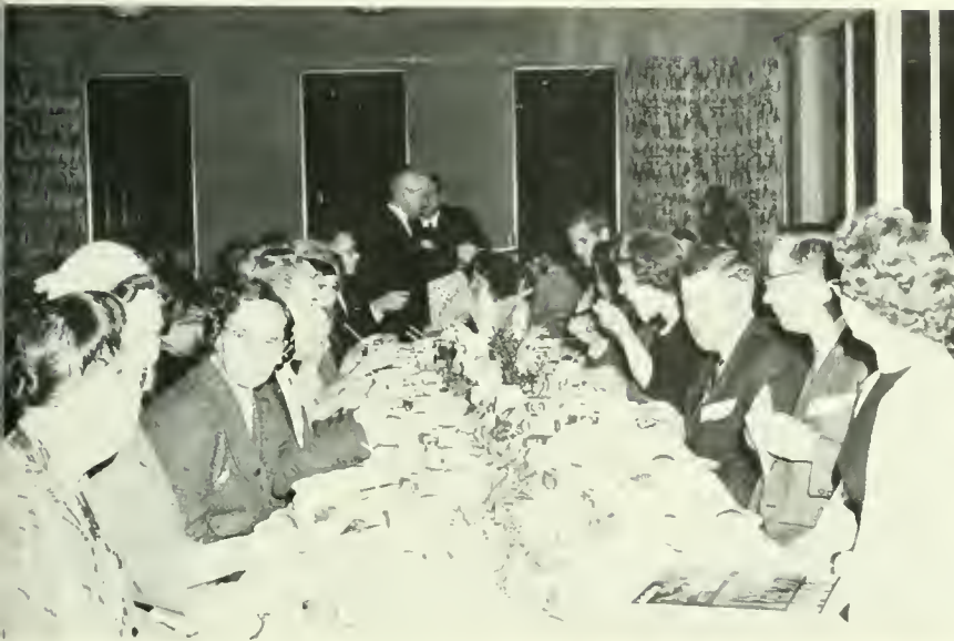
The view from the other end of the table shows the rest of the Honor Classes of 1939 and 1954 that were present.