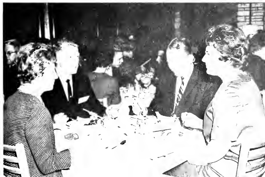
Friends and classmates met for supper and talked about when we were at SMC . . .