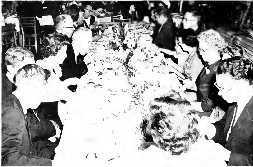
The Honor Classes of 1939 and 1954 enjoy supper in the college dining hall. This view is taken from one end of the table.