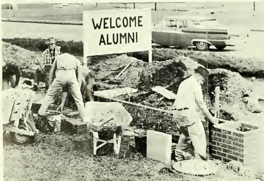
A temporary welcome sign was erected on the site of the new entrance sign, presently under construction. The new sign is a gift of the Alumni Association.