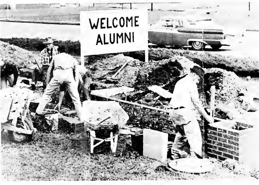
A temporary welcome sign was erected on the site of the new entrance sign, presently under construction. The new sign is a gift of the Alumni Association.