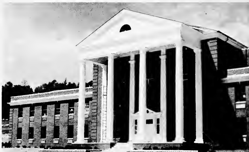
Personnel moves into new Administration Building.