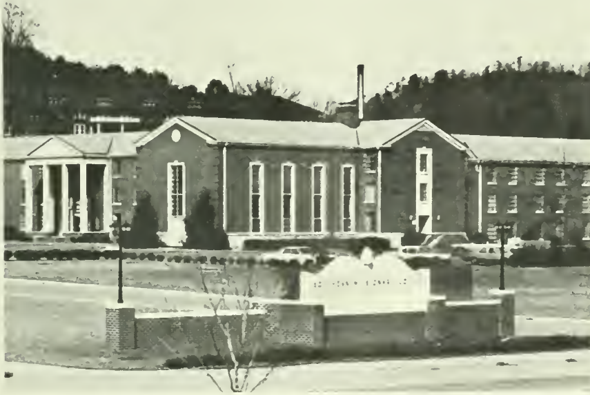
New SMC entrance gate and sign which was made possible by alumni gifts.