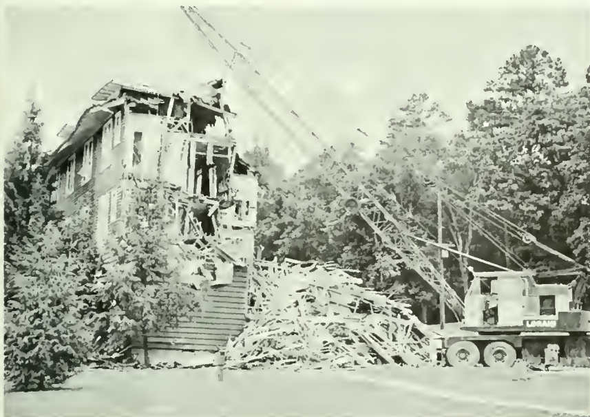
Wrecking crew brings down the north wing of old Talge Hall to make way for new library.