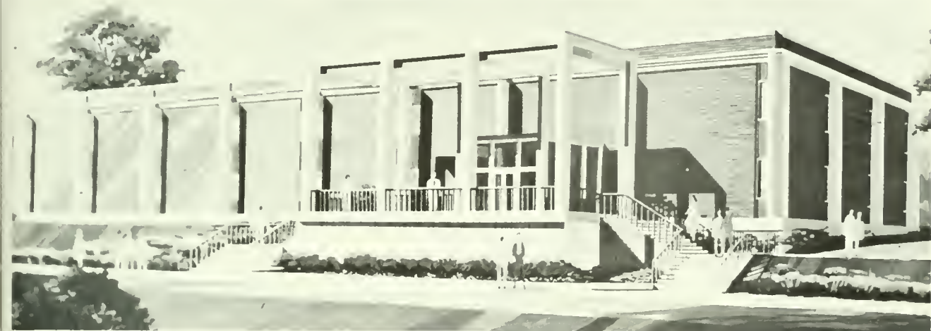
Architect's perspective shows new Library, on which construction starts in September.