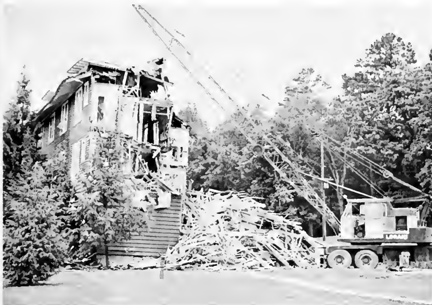
Wrecking crew brings down the north wing of old Talge Hall to make way for new library.