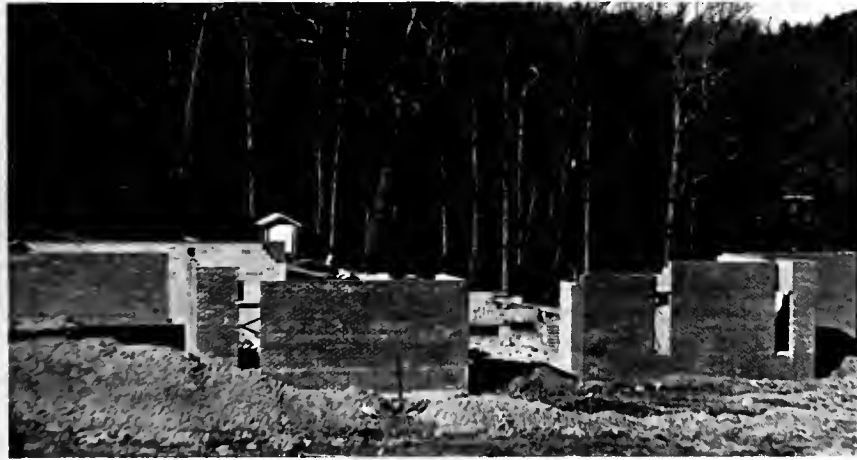
The new Home Economics building is now under construction on the site of the old Collegedale Academy.