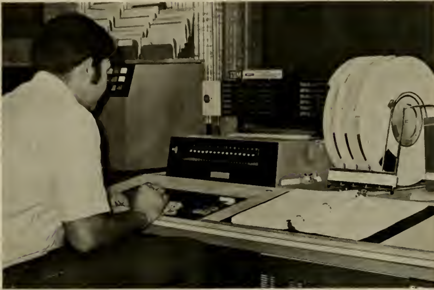
The former library retains the name Daniells, but it now houses the Math, Physics and Computer Departments.

The new computer takes up residence in the recently renovated A. G. Daniells Hall.