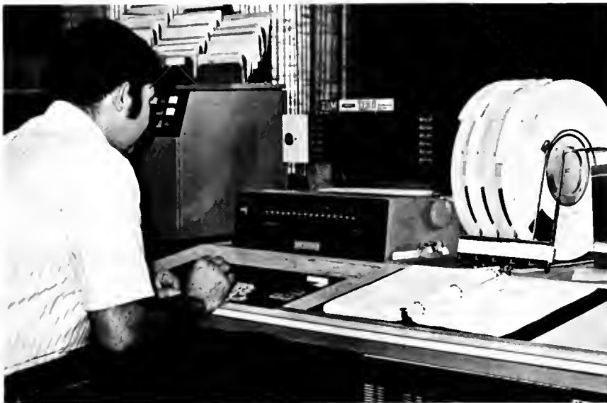
The new computer takes up residence in the recently renovated A. G. Daniells Hall.