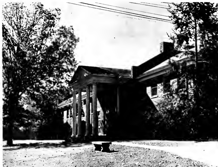
Hackman Hall, formerly housing all the sciences and math, has been remodeled and now has new classrooms and labs for the Chemistry and Biology Departments.