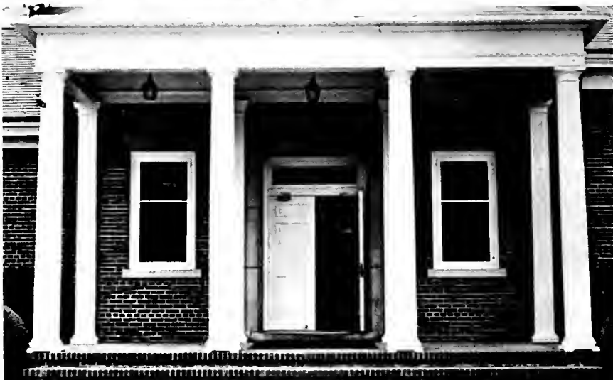
The former library retains the name Daniells, but it now houses the Math, Physics and Computer Departments.