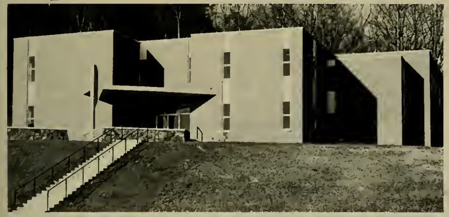
Front view of the new Home Economics Building.