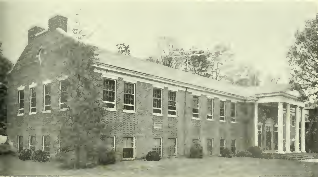
Hackman Science Hall, Southern Missionary College

Yes, you will want to come back home and see at first hand the present and proposed developments since you last viewed Southern Missionary College. A royal welcome awaits you here at your college. Put a circle around the date, May 3-4, and "Come on down to Collegedale."