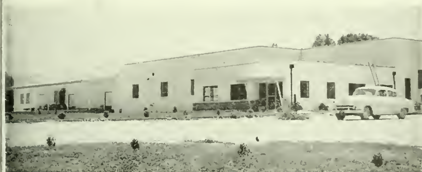
THE NEW KING'S BAKERY