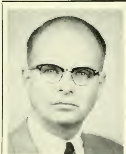
MEET OUR PRESIDENT