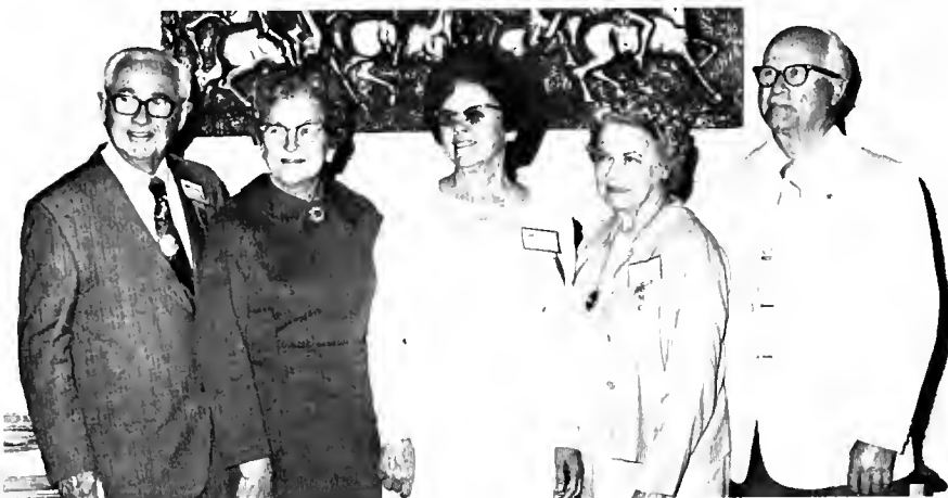
Class of 1926