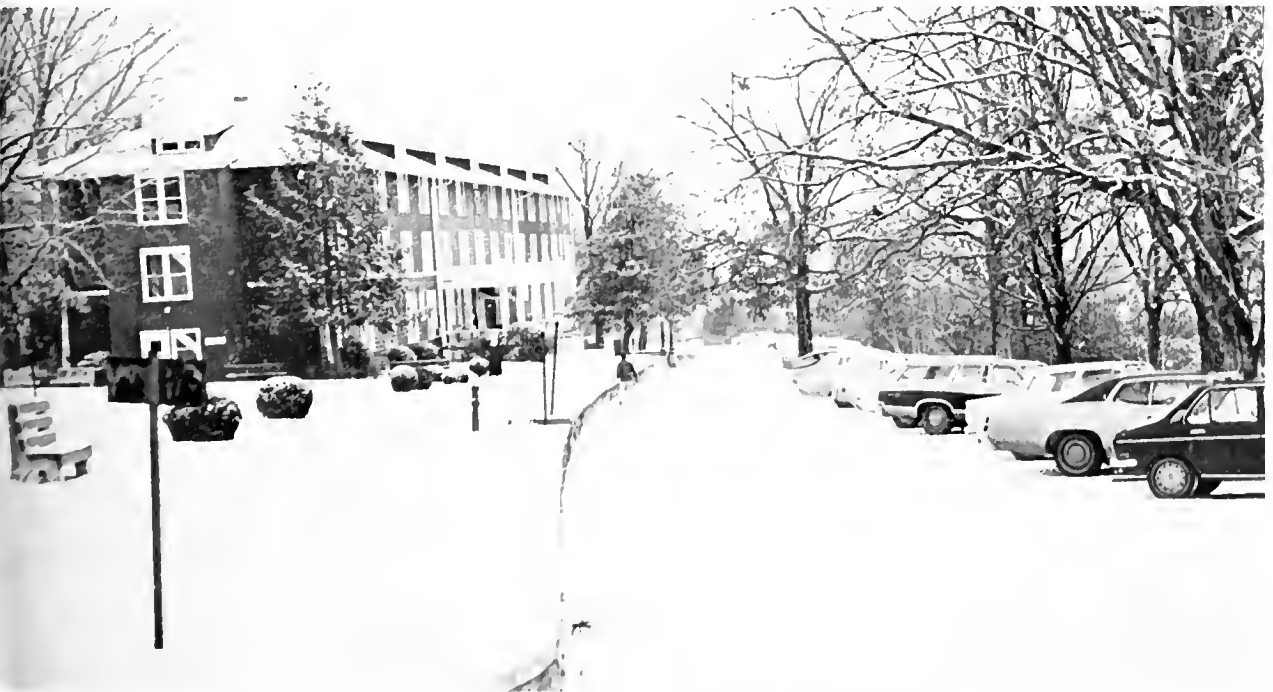
Graduates of SMC have not seen this sight very many times during their stay on campus. This view from Lynn Wood Hall looking toward Maude Jones Hall shows snow-covered roads and sidewalks. The dedicated road crew from General Services Department and Engineering Department cleared paths all over the campus and classes went on as usual.

As this is being written, word came over the wires that this is the coldest winter on record since Colonial times. We know now how the pioneers felt as they trudged over the Appalachian Trail!