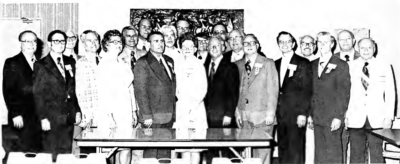
Class of 1951