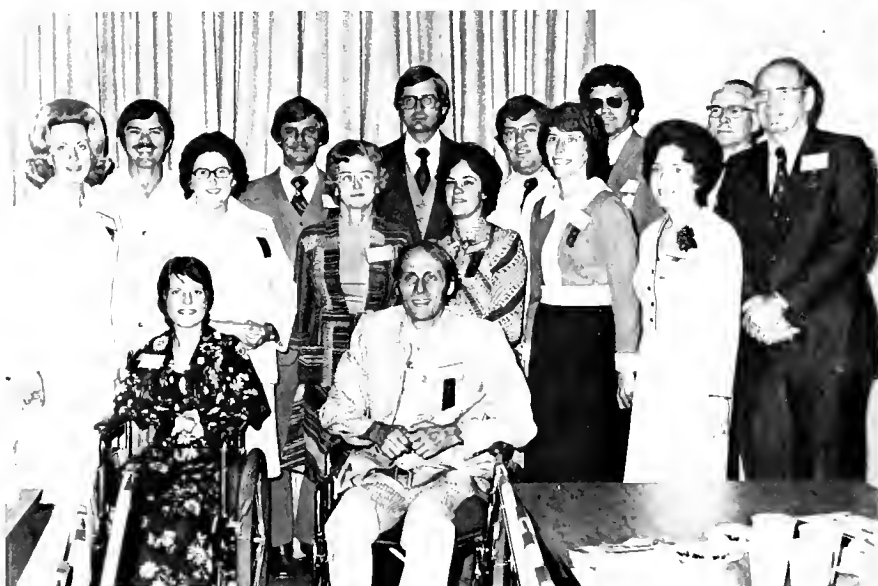
Class of 1966