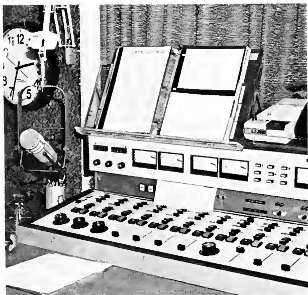
On-Air Control Room

One of these studios will also be used as the control studio for a new commercial campus radio station which began broadcasting on February 16, 1977. The 5-watt AM station will be operated entirely by SMC students who are enrolled in a radio operations class, for which they will receive two hours of college credit. The new station will serve the immediate SMC Campus with music, sports, devotions, and campus information.