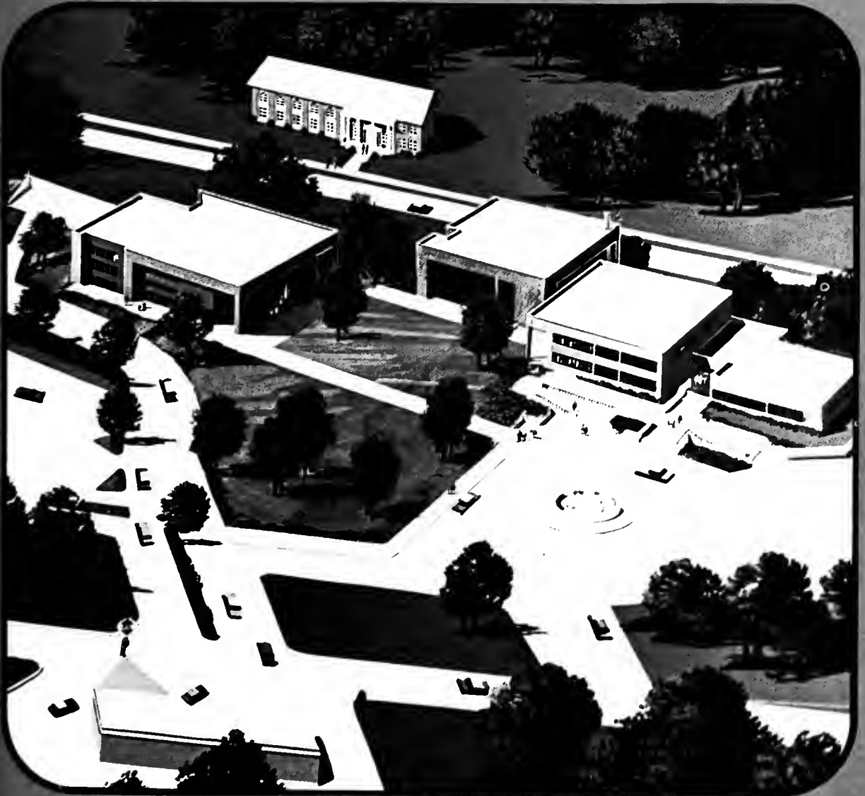
Proposed Southern Missionary College Fine Arts Center