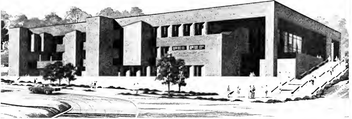
The Music Building