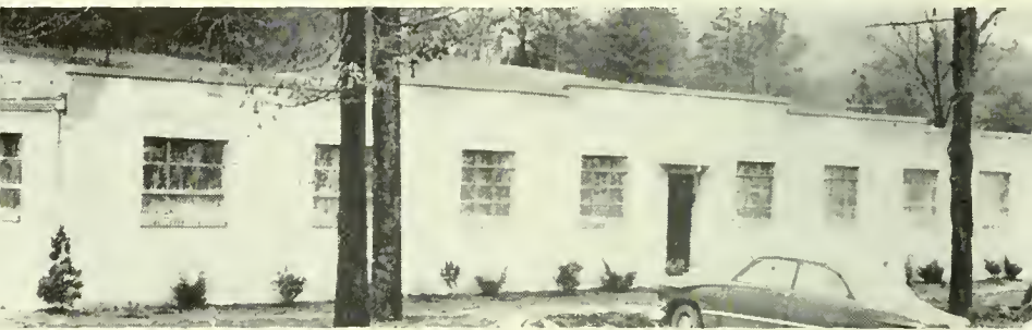
This picture of the new maintenance building was taken one month ago. The landscaping and outside painting have been completed now.