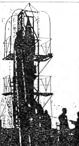
A German A3 rocket, a predecessor of the V2 in the launching pad in 1937. The tall figure on the right is Werner von Braun at 25.

facture jet propulsion, radar and the atomic bomb. Ultimately the resources of the nation was simply insufficient to sustain all these programs at once.