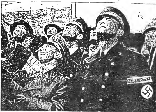
Albert Speer, right, Germany's Armaments Minister, watching a launching of a V2 rocket with Joseph Goebbels, left, Minister of Propaganda.

Richard J. Evans is the author of the forthcoming "Rituals of Retribution: Capital Punishment in German Politics and Society Since the 17th Century."