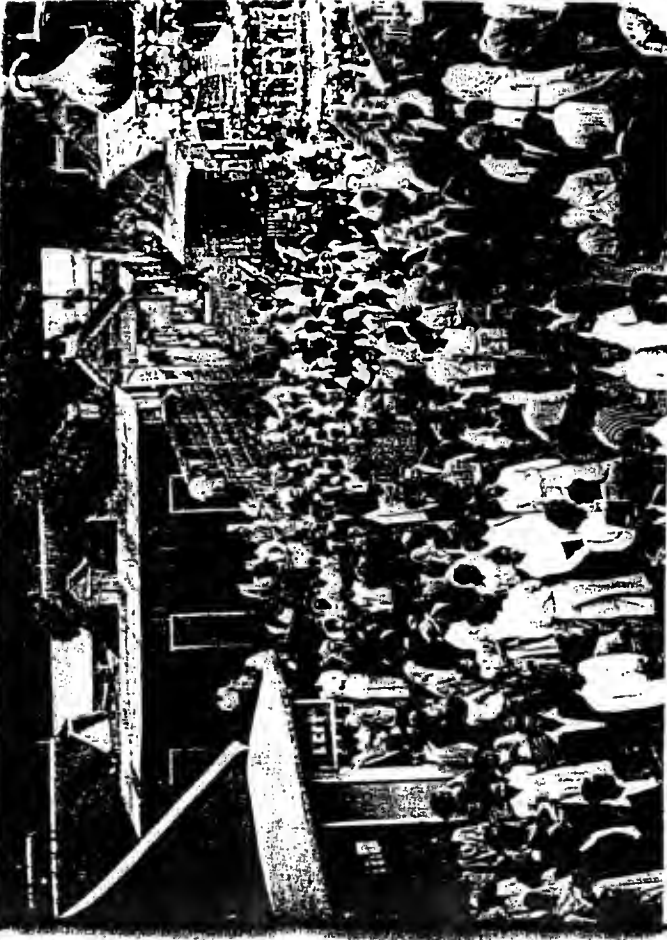
Muslim Ghoon festival, Port Louis.

ethnic groups of Mauritius, Hindus look outside the island to their country of ancestral origin for a charter for many aspects of their beliefs and behavior. The fact that India officially supported birth control convinced most Indo-Mauritian Hindus that there could be no major religious grounds for opposing it. By language and sect Hindus can be divided into at least a dozen categories, but such sects are not organized on an islandwide basis comparable to a church which can pronounce dogma. This militates against organized objections to birth control on religious grounds.