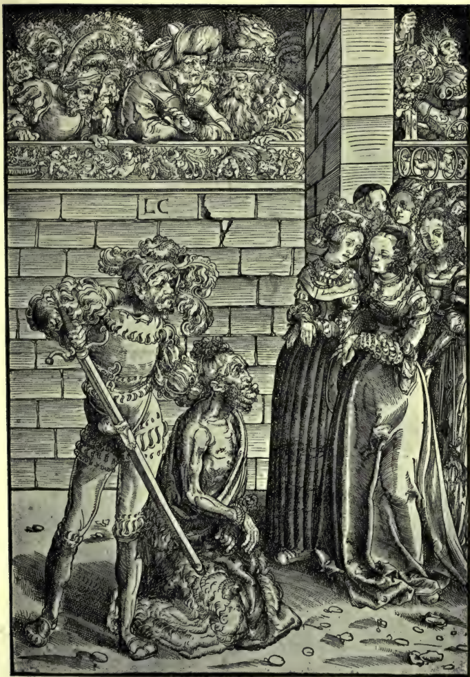
AN EXECUTION AT THE TIME OF THE REFORMATION.