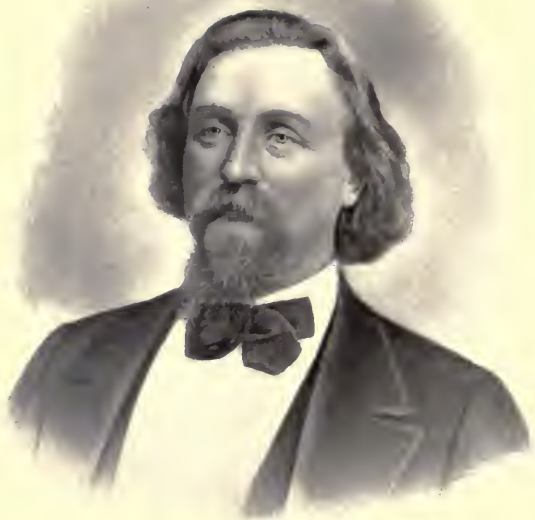
GEN. GEORGE EDWARD PICKETT