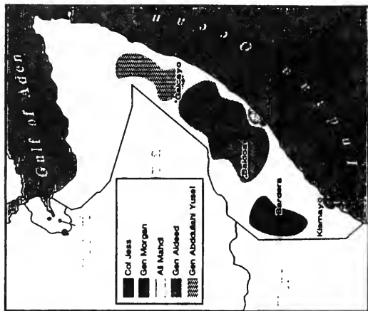
Figure 2. Principal warlords of southern Somalia, March 1993.

Some political initiatives did take place during the UNITAF period. Spurred by UNITAF and the US Liaison Office (USLO), 14 southern Mogadishu warlord Aideded and northern Mogadishu leader Ali Mahdi signed a cease-fire and a general truce on 11 December 1992. Their seven-point agreement called