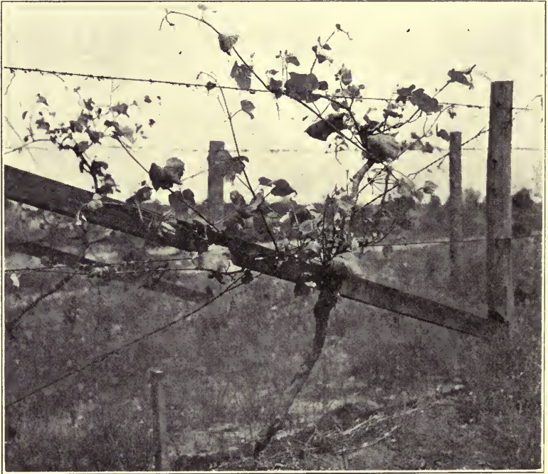
FIG. 2.—CONCORD VINE SEVERELY PRUNED TO 16-25 NODES, 1924-1929