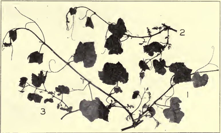
FIG. 7.—FLOWERING SHOOTS FROM A HEAVILY PRUNED, A MODERATELY PRUNED, AND AN UNPRUNED CONCORD VINE

Both terminal and lateral shoots from each group of canes were shortest at the base of the cane and increased in length as they originated nearer the tip. Apparently the shoot-vigor pattern of a vigorous cane, like its productiveness, tends to increase with the buds farther out from the base to at least the sixteenth node. This probably explains most of the correlation found between shoot growth and produc-