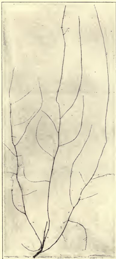
FIG. 3.—CANE FROM CONCORD VINE PRUNED TO 16-25 NODES, 1924-1928

(Table 3). There seemed to be little relationship between shoot vigor and the previous year's fruit-bud formation, tho the extent of fruit-bud formation appeared to have considerable effect upon the production of a shoot the following year.