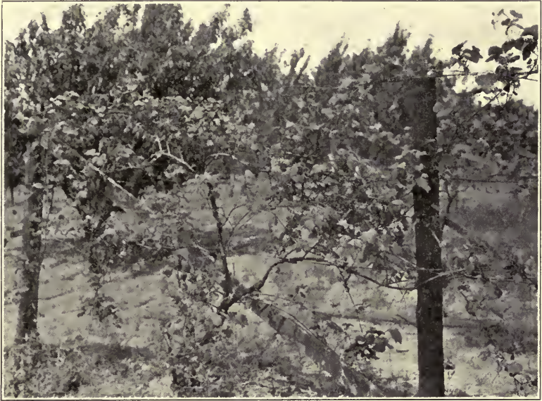
FIG. 6.—CONCORD VINE MODERATELY PRUNED TO 50 NODES IN 1928, WITH NO PRUNING IN 1929

ing. The distribution of the 199 canes left on the 48 vines in 1927 and the 225 canes of 1928, according to length in number of nodes and pruning treatment of the vine supporting them, is shown in Table 8. The average activity of the different length canes proved to be directly