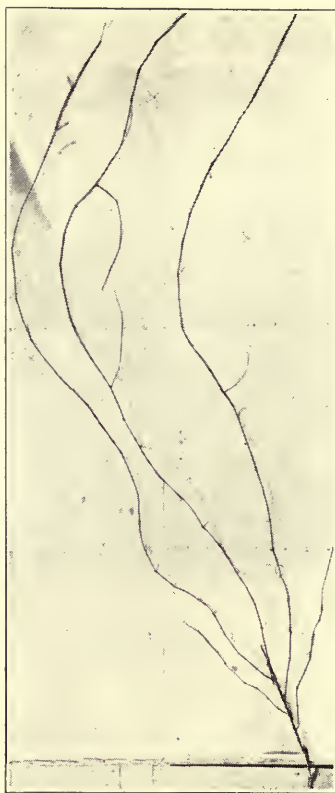
FIG. 5.—CANE FROM CONCORD VINE PRUNED TO 56-65 NODES, 1924-1928

Two other conditions resulting from the pruning need to be taken into account in this connection. First, more severe pruning resulted in an increase in the percentage of shoots broken by various causes, such as storms and tools used in cultivation (Item 5). This may be explained by the fact that the smaller number of shoots afforded less