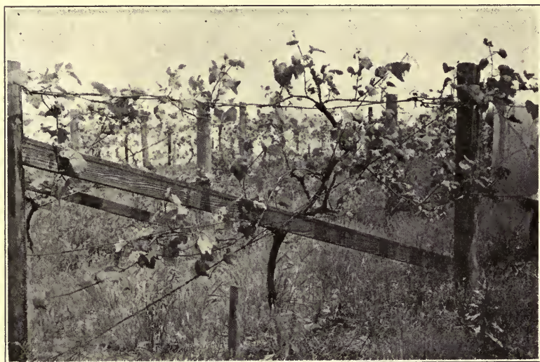
FIG. 4.—CONCORD VINE PRUNED TO APPROXIMATELY 60 NODES DURING 1924-1929

The growth and fruiting activities of the different groups of vines varied with the treatments they received (Table 1 and Figs. 2, 4, and 6). The number of shoots was limited in proportion to the number