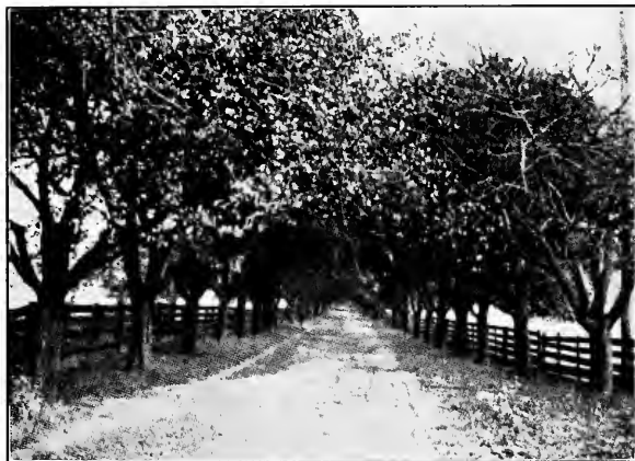
"LOVERS LANE" AT ECONOMY. APPLE TREES IN BLOOM.