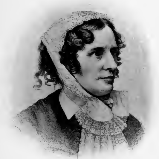
Isabella Beecher Hooker