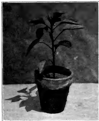
FIG. 2.—TYPE OF PLANT USED IN THE TESTS. GROWN IN 4-INCH POT

The object of making these combinations of treatments was to determine whether fruitfulness in the pepper could be stimulated by the use of phosphorus, which is supposed to increase the yields of fruit-bearing plants; or whether fruitfulness in the case of this plant might be associated with a strong vegetative growth. Irrigation was resorted to as one means of promoting vegetative growth. With a view to stimulating such growth still further, if possible, nitrate of soda was used in addition to irrigation on one of the lots.