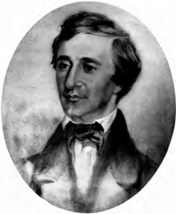
Henry D. Thoreau, age 37.