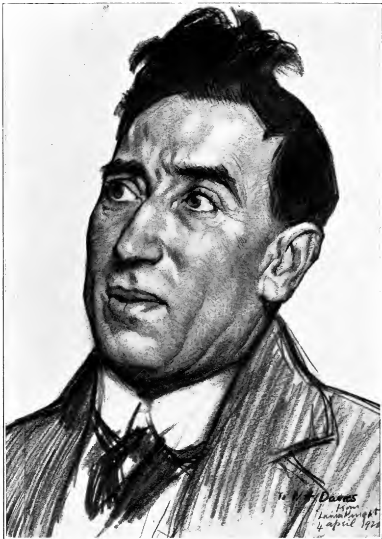
W. H. DAVIES, 1920 A Portrait by Laura Knight