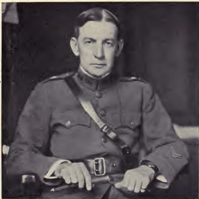
BRIGADIER GENERAL CHARLES G. DAWES General Purchasing Agent, A. E. F.