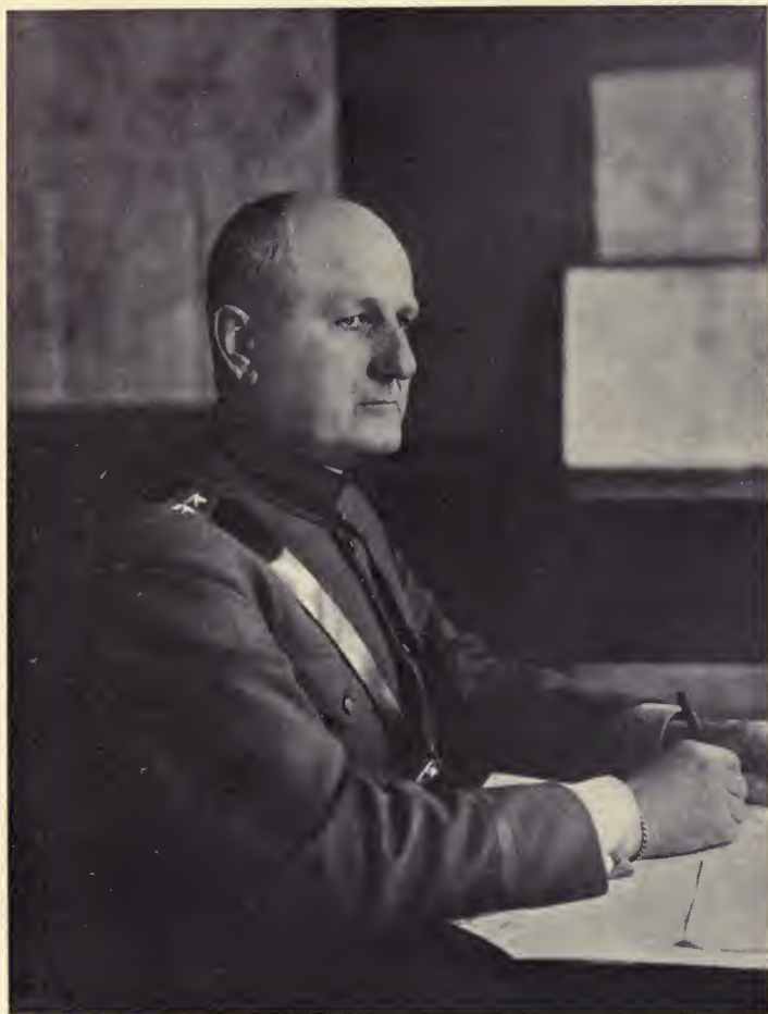
MAJOR GENERAL JAMES G. HARBORD Commanding General of the S. O. S., A. E. F.