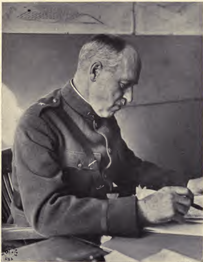
BRIGADIER GENERAL W. W. ATTERBURY Director General of Transportation, A. E. F.