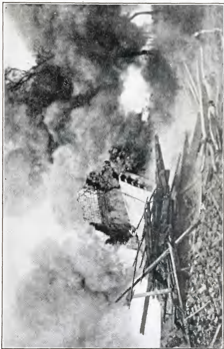
British Battery in Action