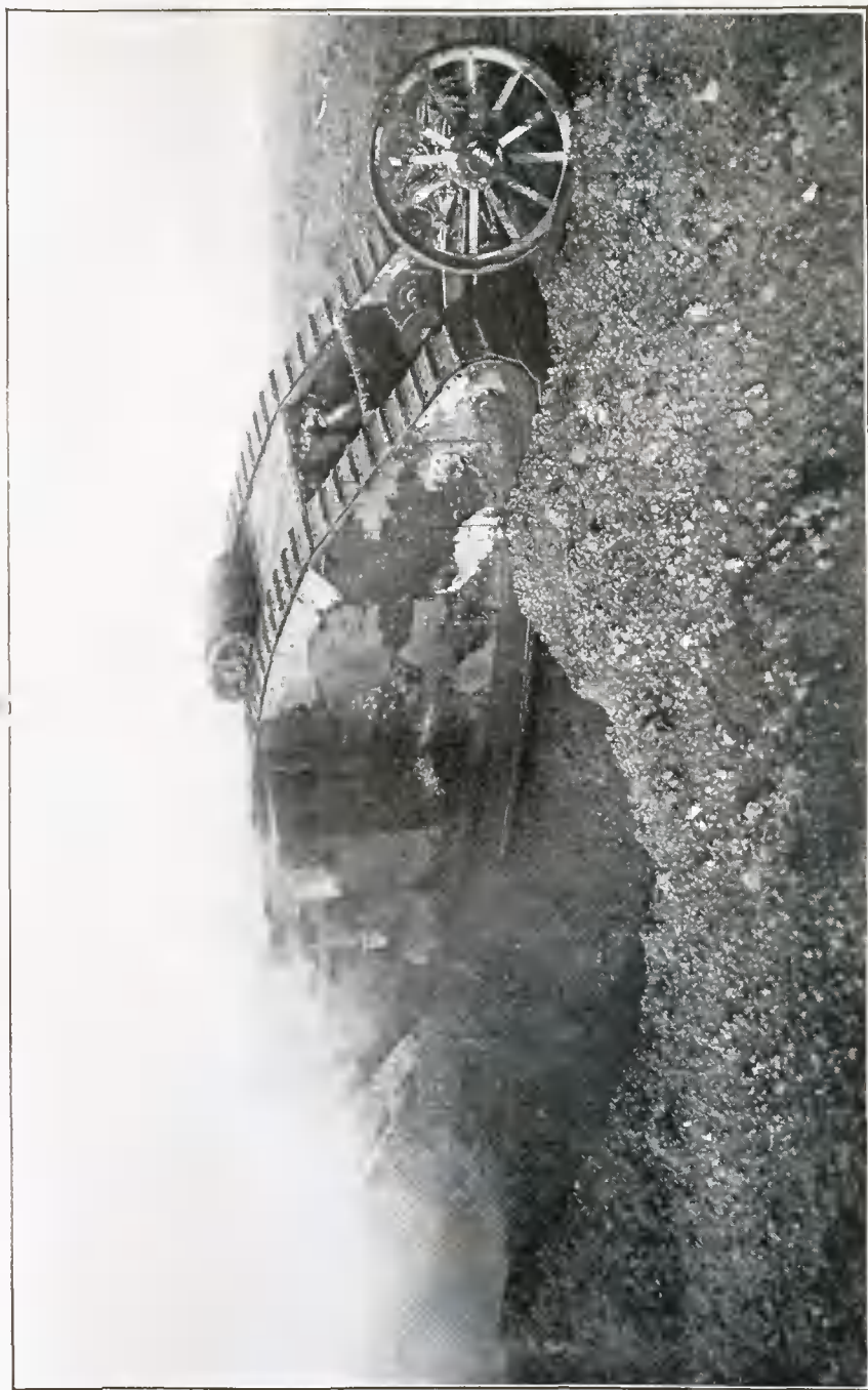
Behemoth in Battle