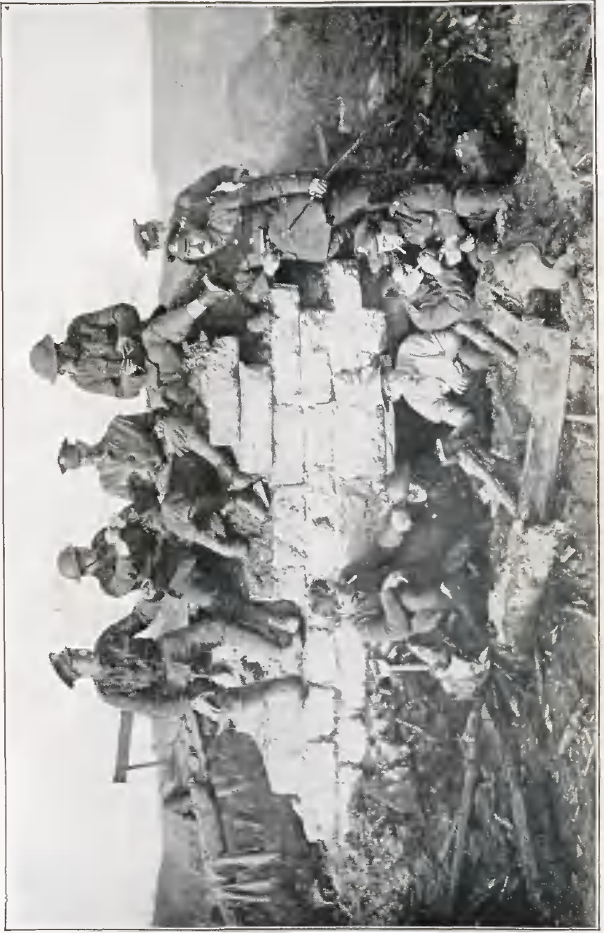
Ex-German "Pill Box" That Is Now a British Dugout