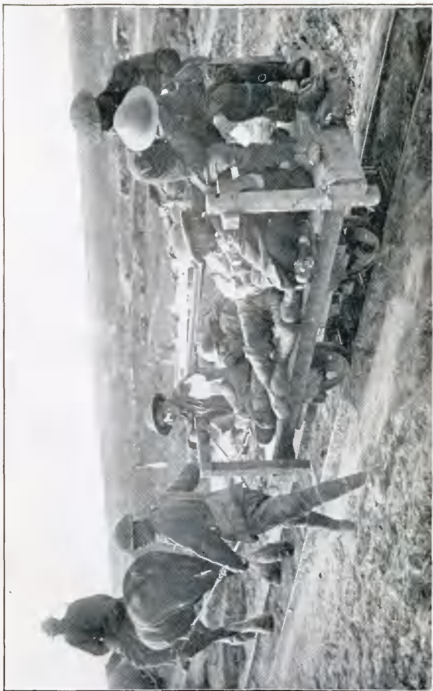
Victorious, But Dead Tired