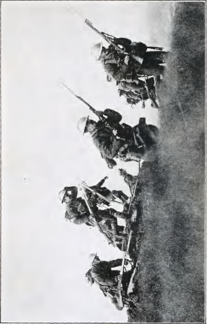
Over the Top