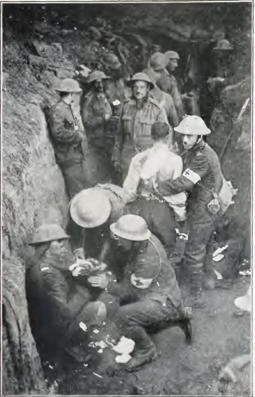
Patching up the "Pipped"