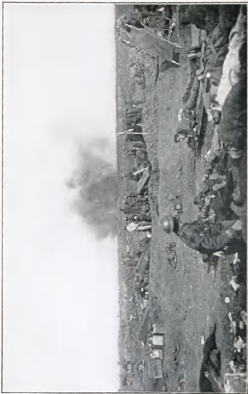
A First Line Hospital