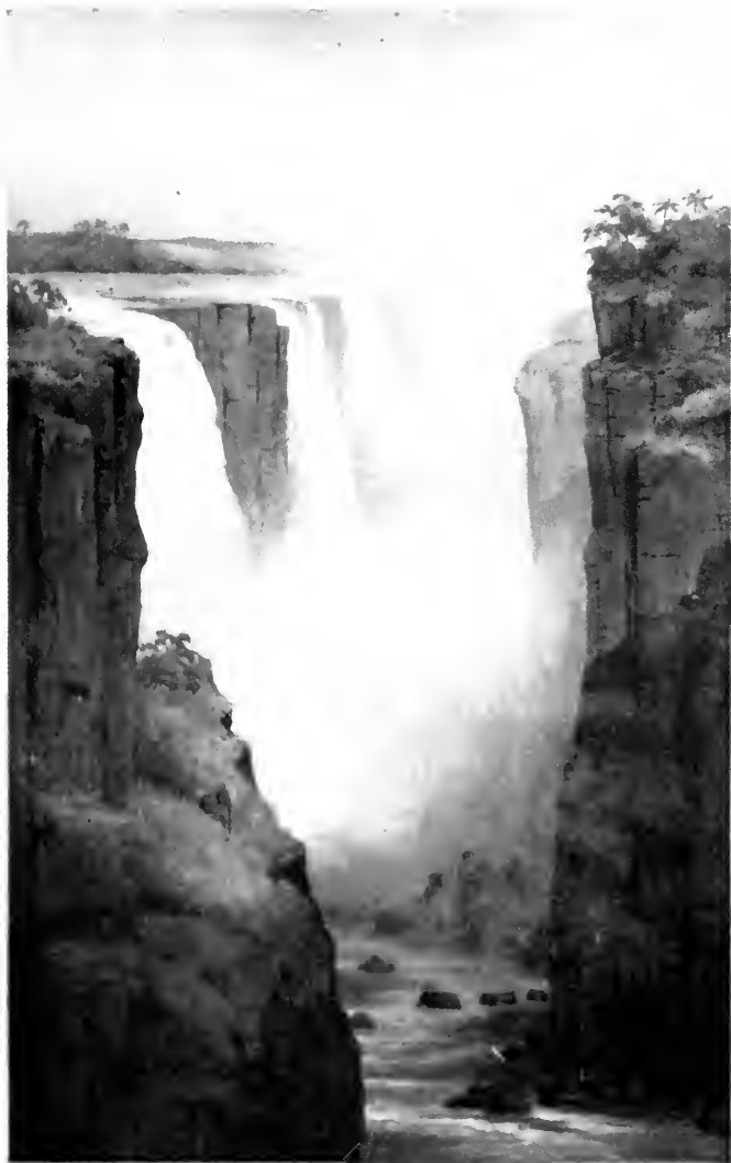
VICTORIA FALLS ON THE ZAMBEZI PAGE 41