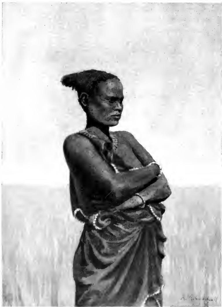
A ZULU WOMAN

(Her hair is dressed with red clay.) Page 27