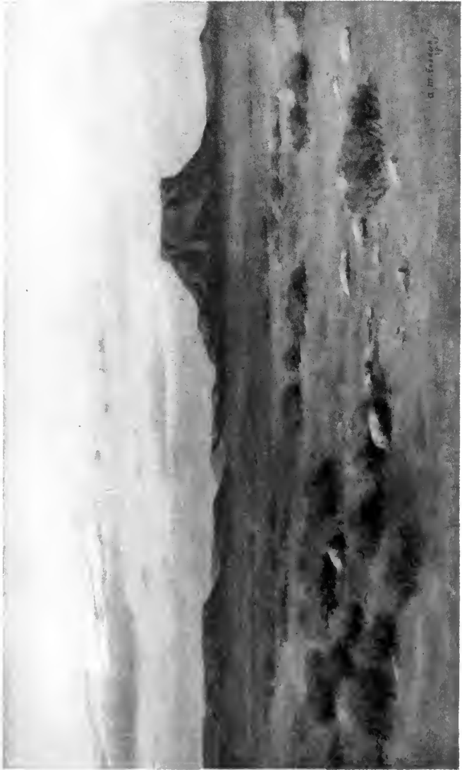
ON THE KAROO / 176