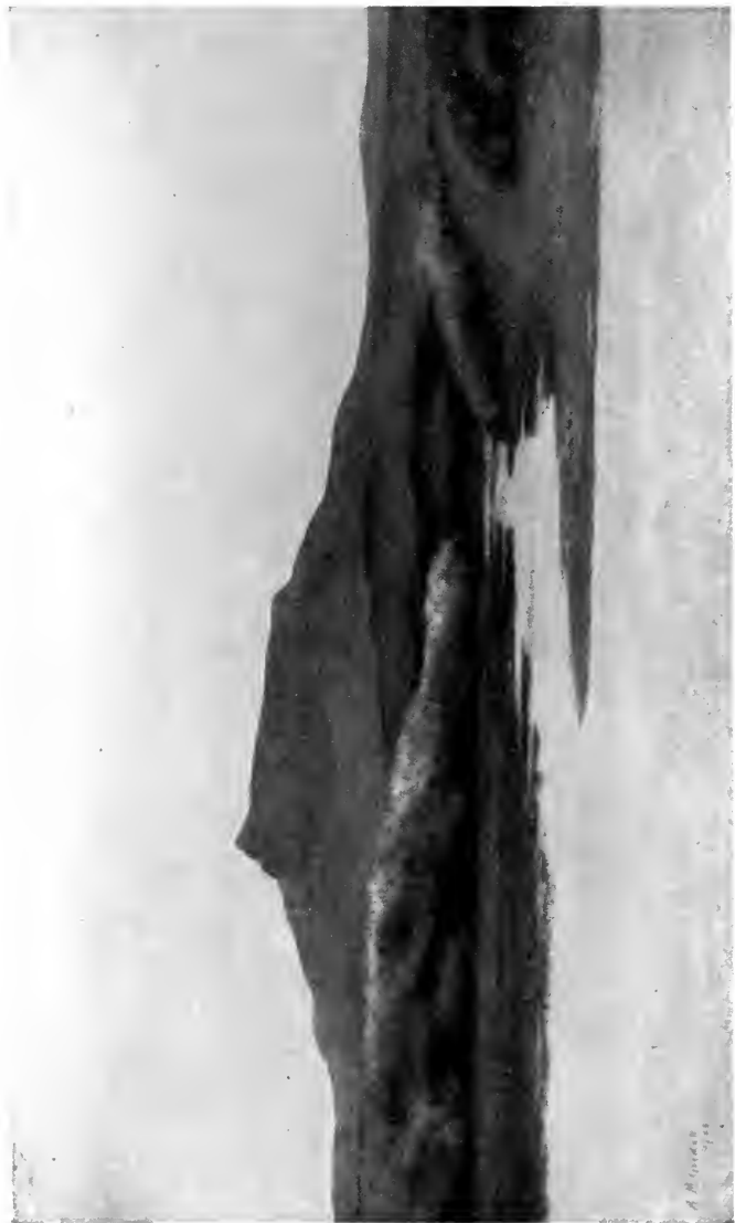
A RIVER DRIFT OR FORD.