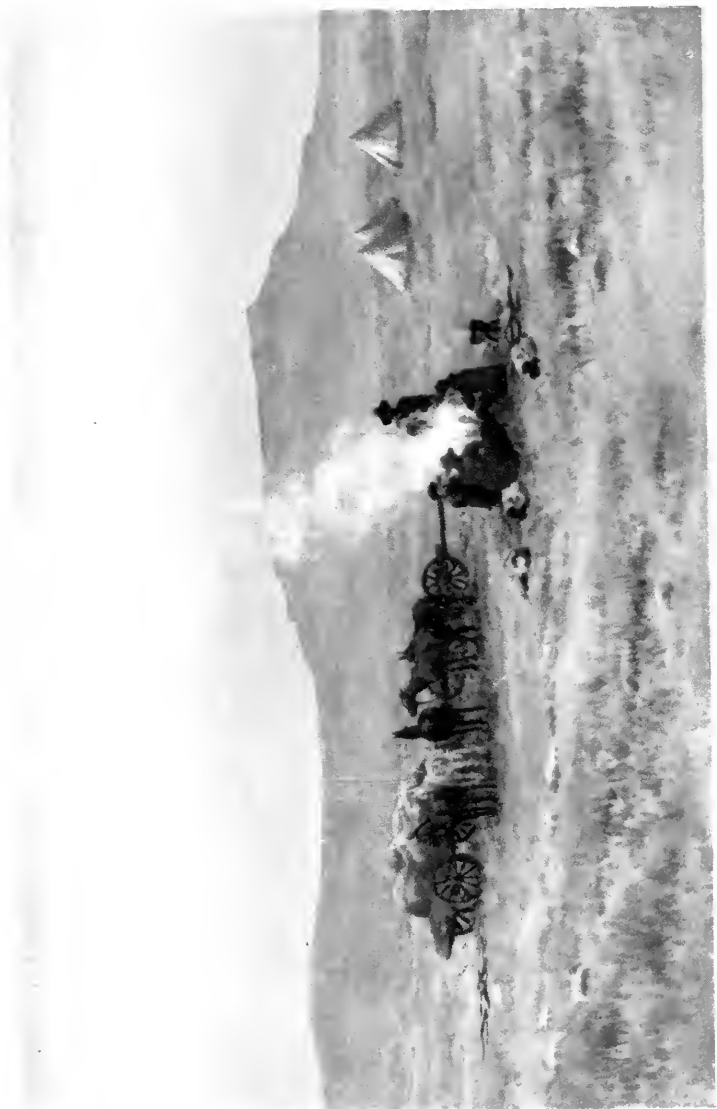
ROUND THE CAMP FIRE - CHAPTER VI.