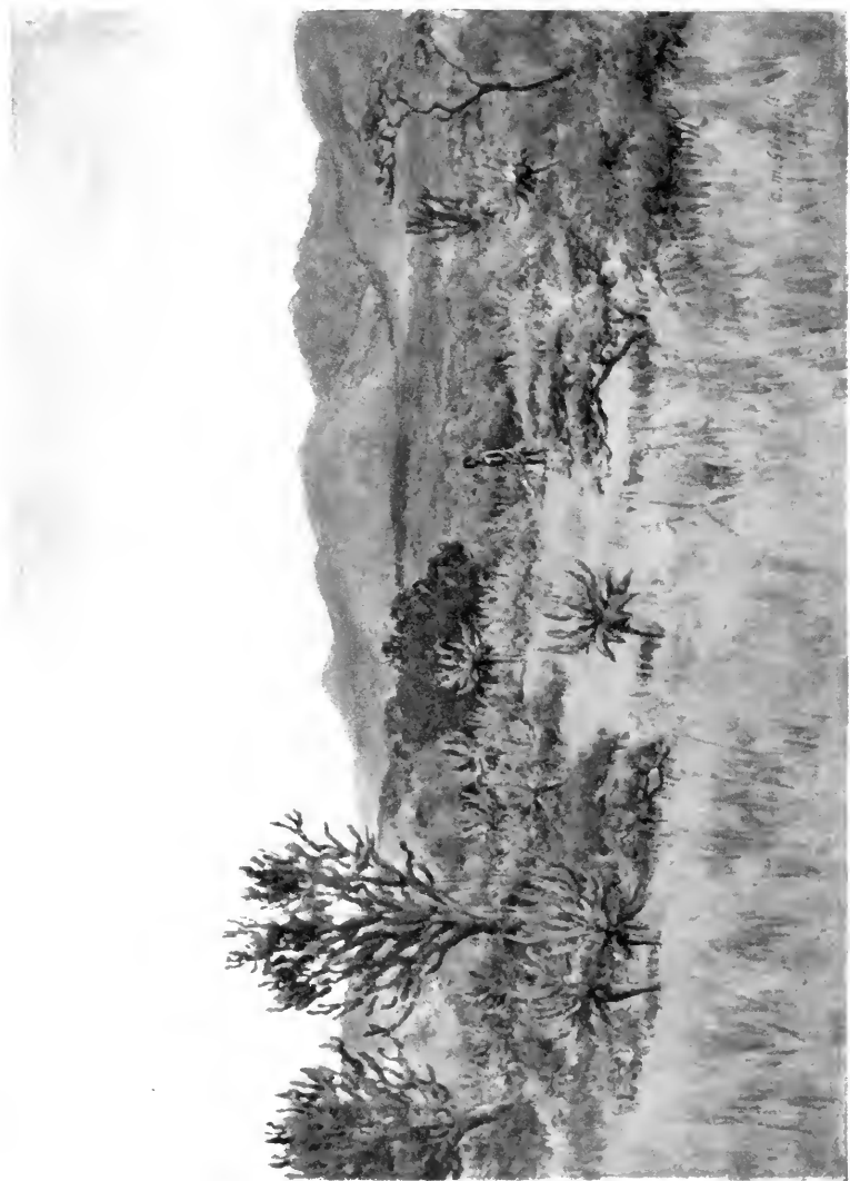
HUNTING ON THE BUSH VELO.