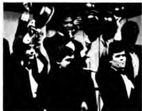
The Die Meistersingers performed.

Symphony Orchestra, and the Chorale. This event was well attended and drew much appreciation from the listeners.