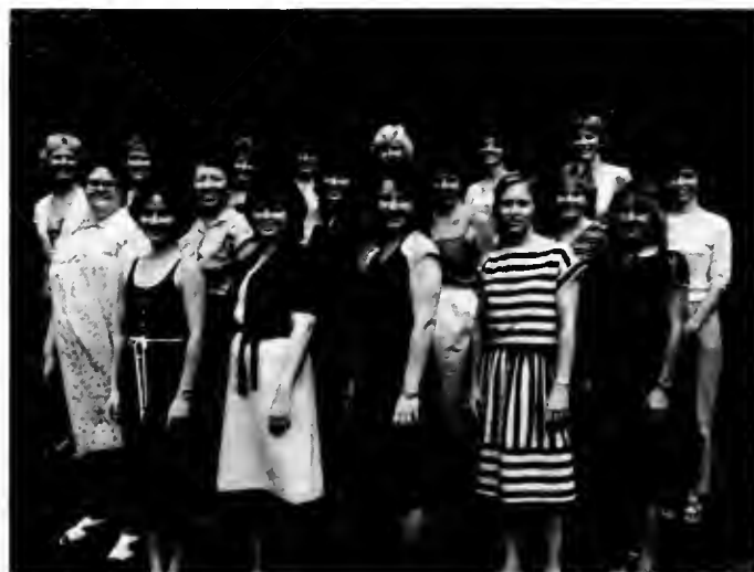
B.S. nursing class members from the class of 1973.