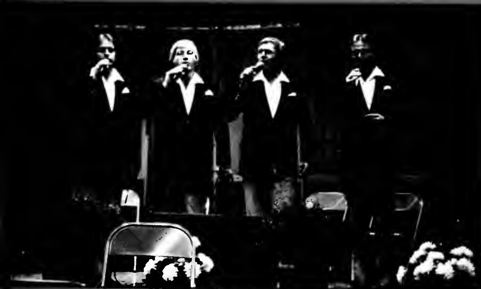
The Heralds (formerly the Kings' Heralds) performed Sabbath afternoon to a capacity crowd.