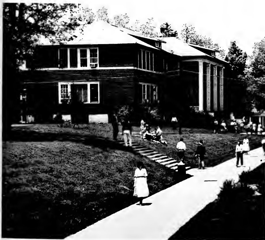
Lynn Wood Hall in 1962

The SOUTHERN COLUMNS salutes Lynn Wood Hall and the man of vision that it was named after.