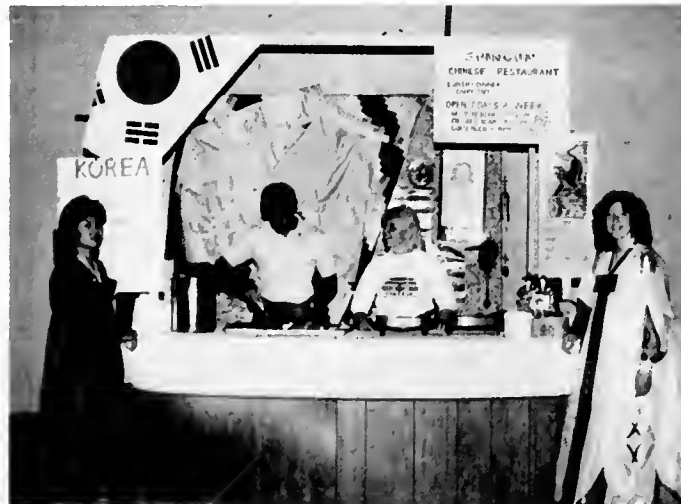
One of the many booths at the food fair.