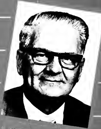
Dr. [Name] will be present in the Society.