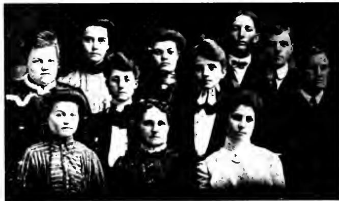
Recognize any of these? The photo was taken at the Graysville, Tenn., campus around the turn of the century, before the school moved south some 50 miles to Collegedale.