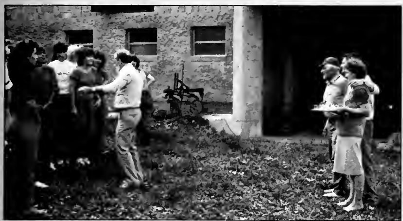
This informal concert at a Yugoslavian farm made new friends for the Chamber Singers.