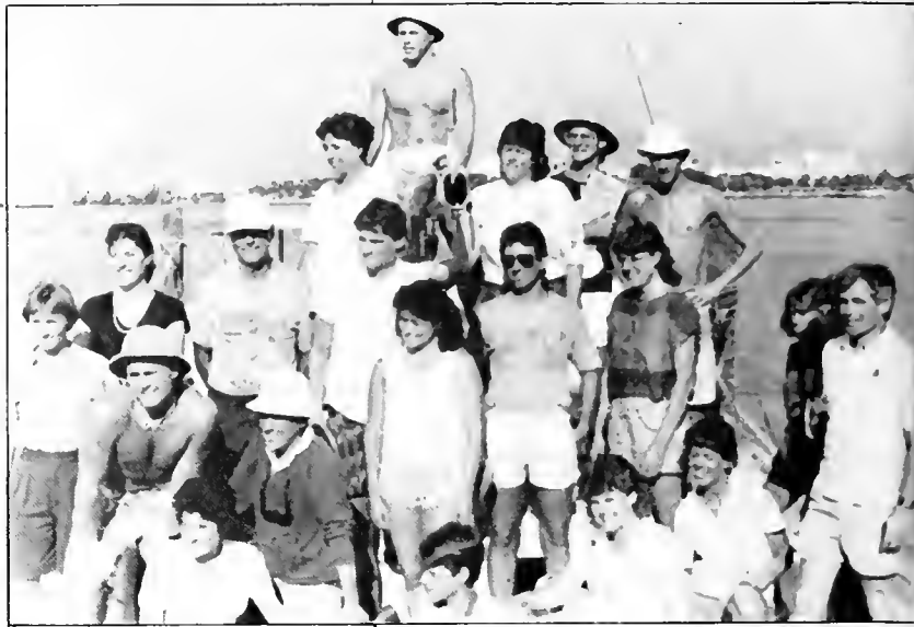
The seafaring students and crew of the Shark XII.