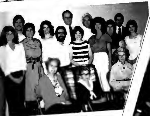
Washington, D. C.