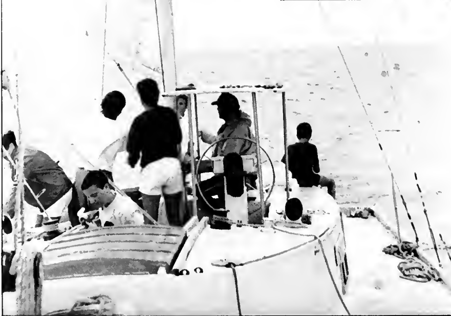
Smooth sailing on the Shark XII.