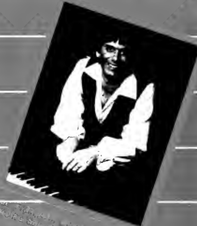
For the sake of our former students, please contribute to the fund.

Look in at what's for you at Homecoming Alumni Oct. 25-27