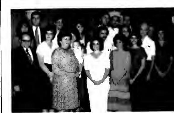
Spartanburg, South Carolina