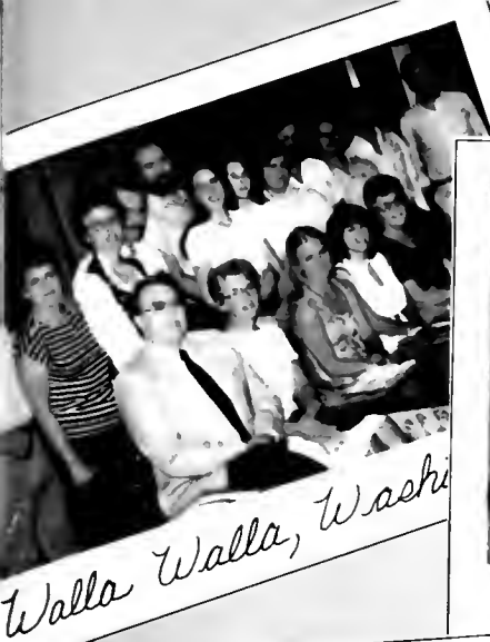
Walla Walla, Washi