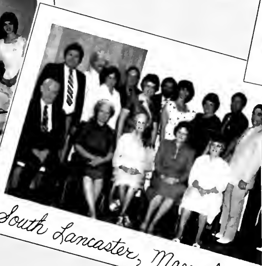
South Lancaster, Massachusetts