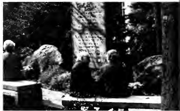
A chat in the Garden of Prayer