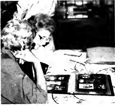
Heritage Room discoveries