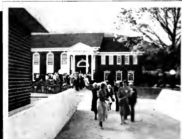
Leaving the Religion Center, So-Ju-Conian Hall