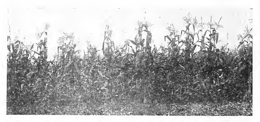
Corn and Soybeans grown together for Silage on the Agronomy Farm

Where soybeans were seeded solid at the rate of six pecks per acre the plots were one drill-width wide, or a little more than 8 feet, and the same length as the other plots. In this case the two outer drill rows on each side of the plot were cut and discarded before harvesting the rest of the plot in order to eliminate border effect as much