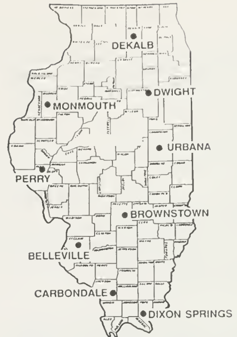
1991 TEST FIELDS (con't.)

Harvest dates: September 11 & October 1.